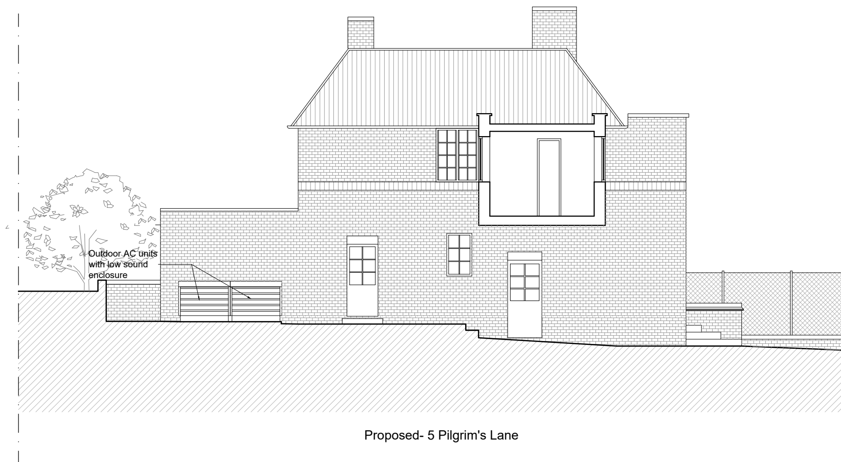
Proposed- 5 Pilgrim's Lane