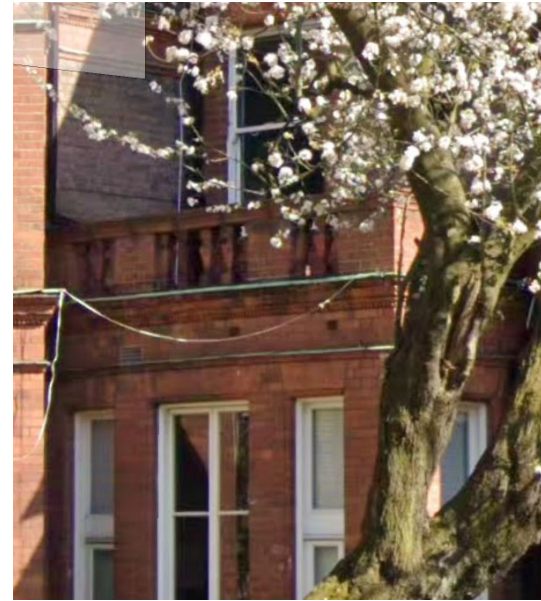
Balcony as existing