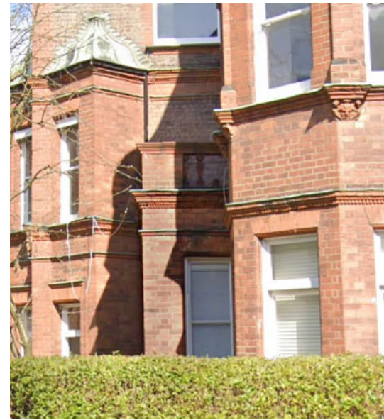
Balcony as existing