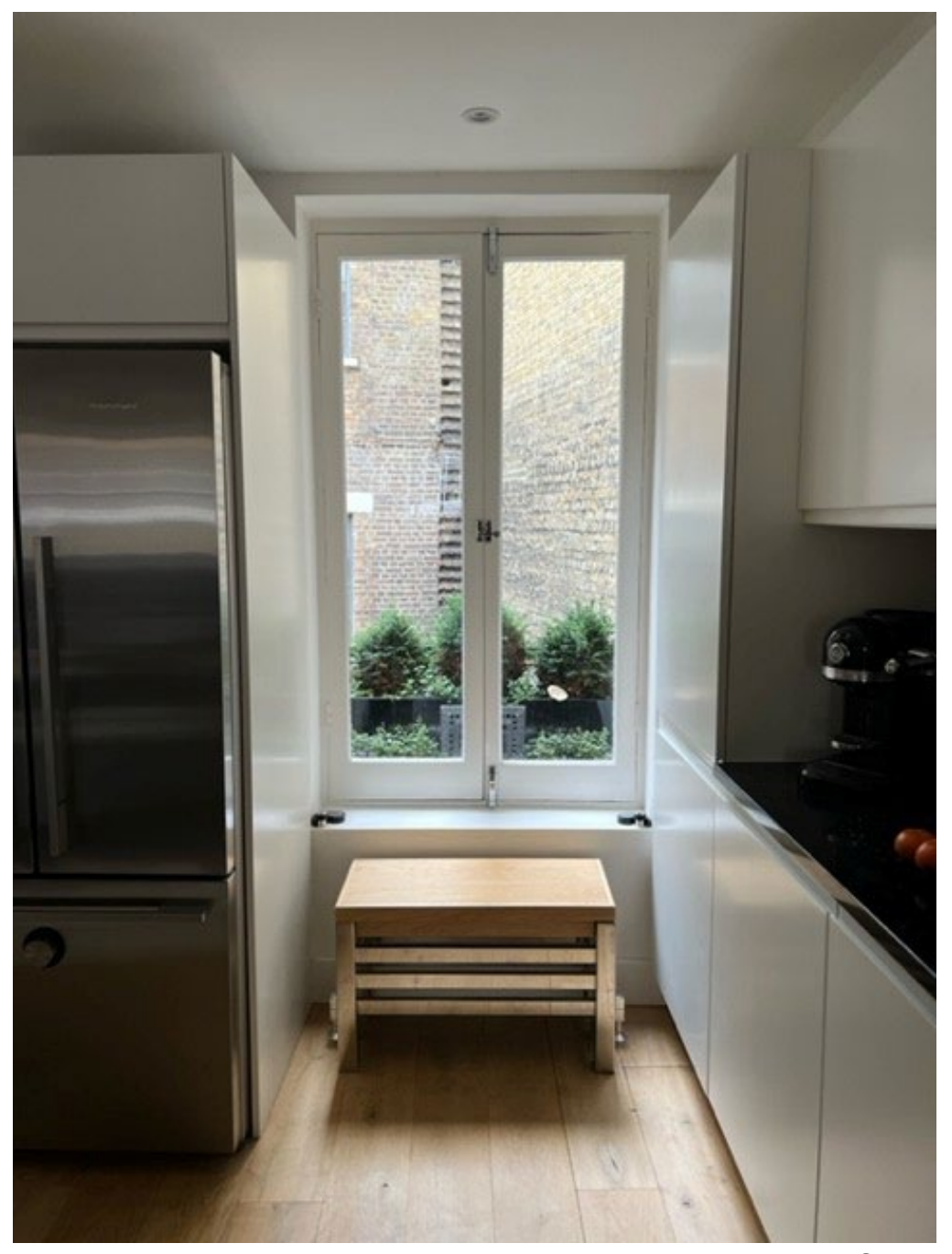
The proposed French door will be similar to Flat F, 40 Earlham Street. Photograph taken from inside Flat F.

Timber French doors are proposed to match those already existing as in the ones in the two flats above.