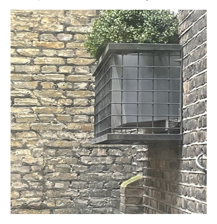
Balcony existing above proposal site