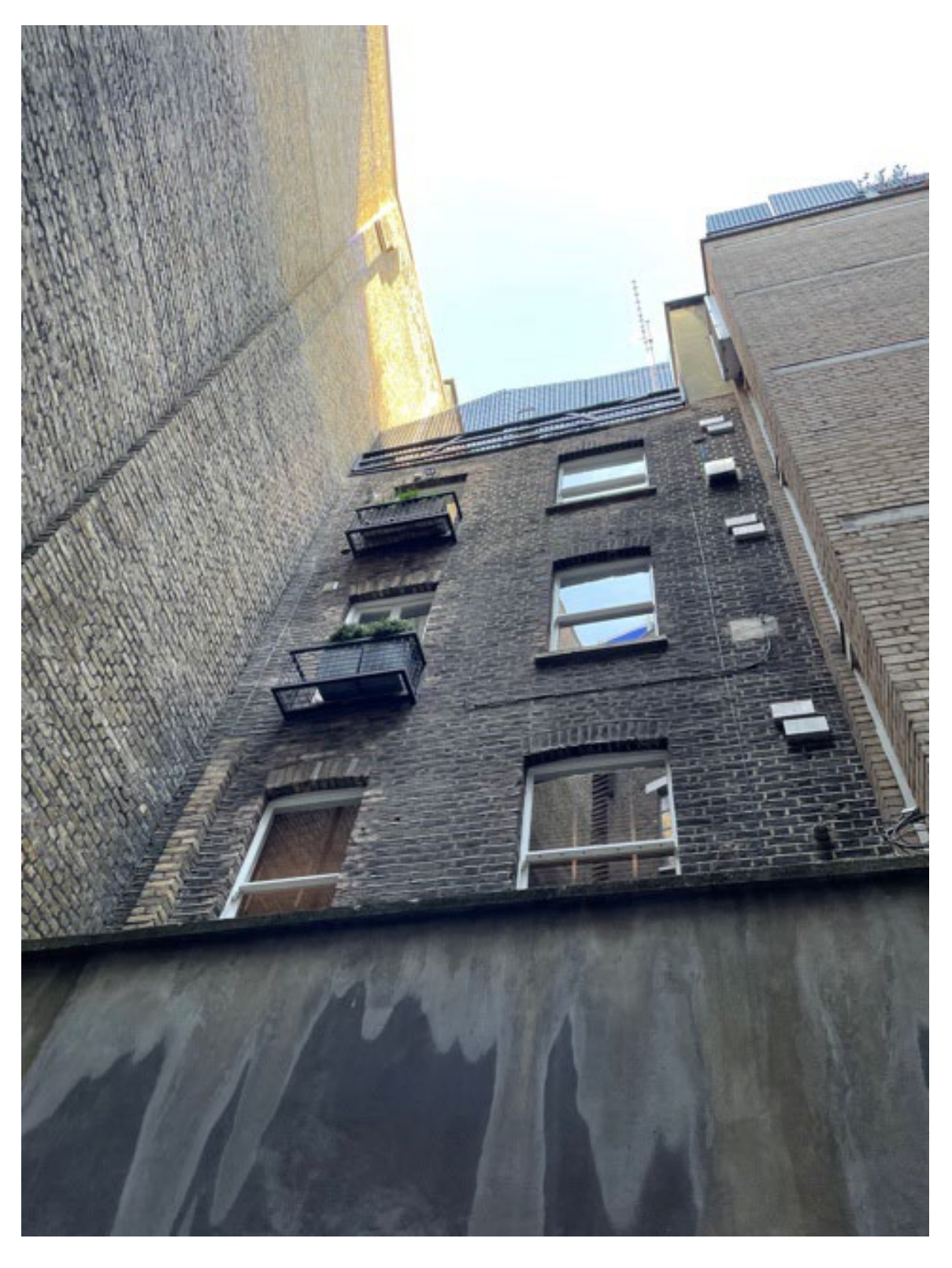
Existing views of the rear elevation of 40 Earlham Street.