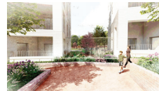
Glimpsed views from Belsize Road into the courtyard