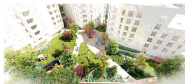
Landscape garden courtyard