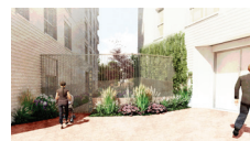
Glimpsed views from Abbey Road into the courtyard