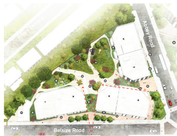
Phase 3 Illustrative Landscape Plan