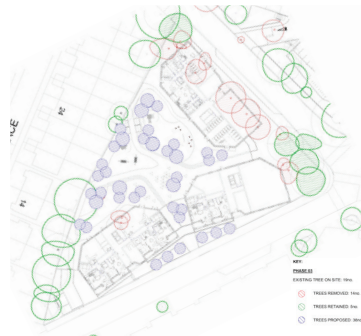
Abbey Area Phase 3- Tree Strategy