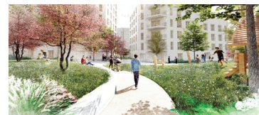
Garden courtyard terrace