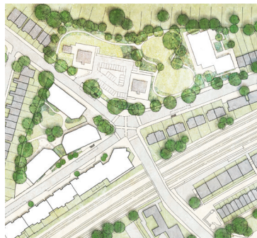
Overall Abbey Area Masterplan