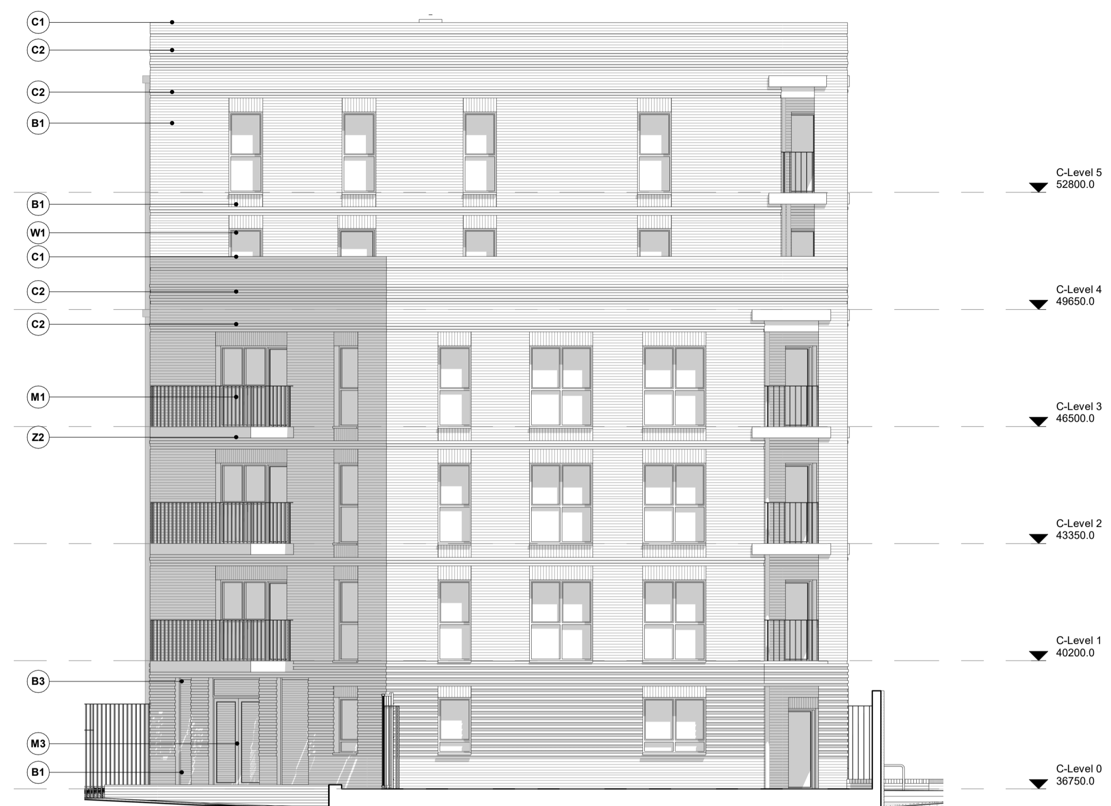
2 Block C - West Elevation Scale: 1 : 100