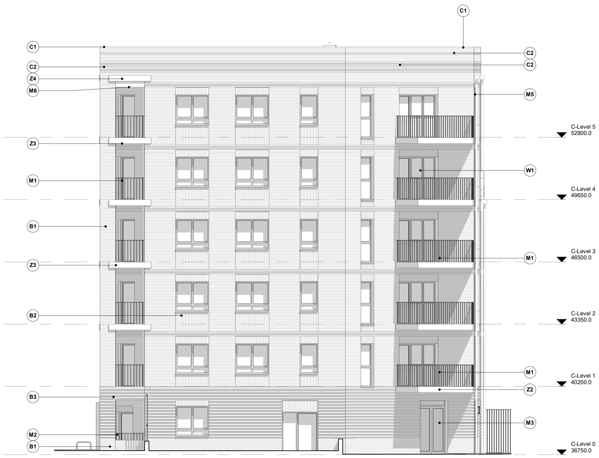
1 Block C - East Side Elevation Scale: 1 : 100