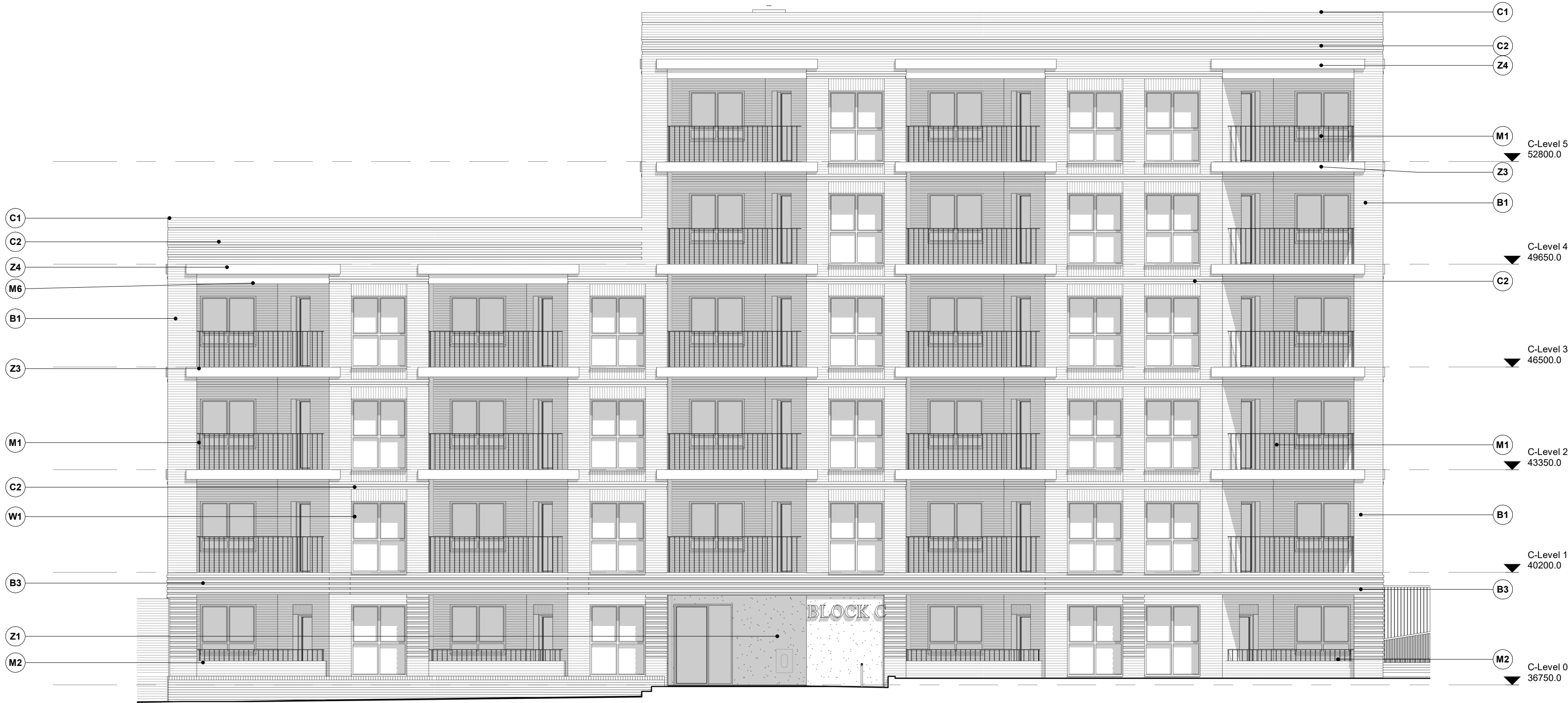
1 Block C - Front Elevation Scale: 1 : 100