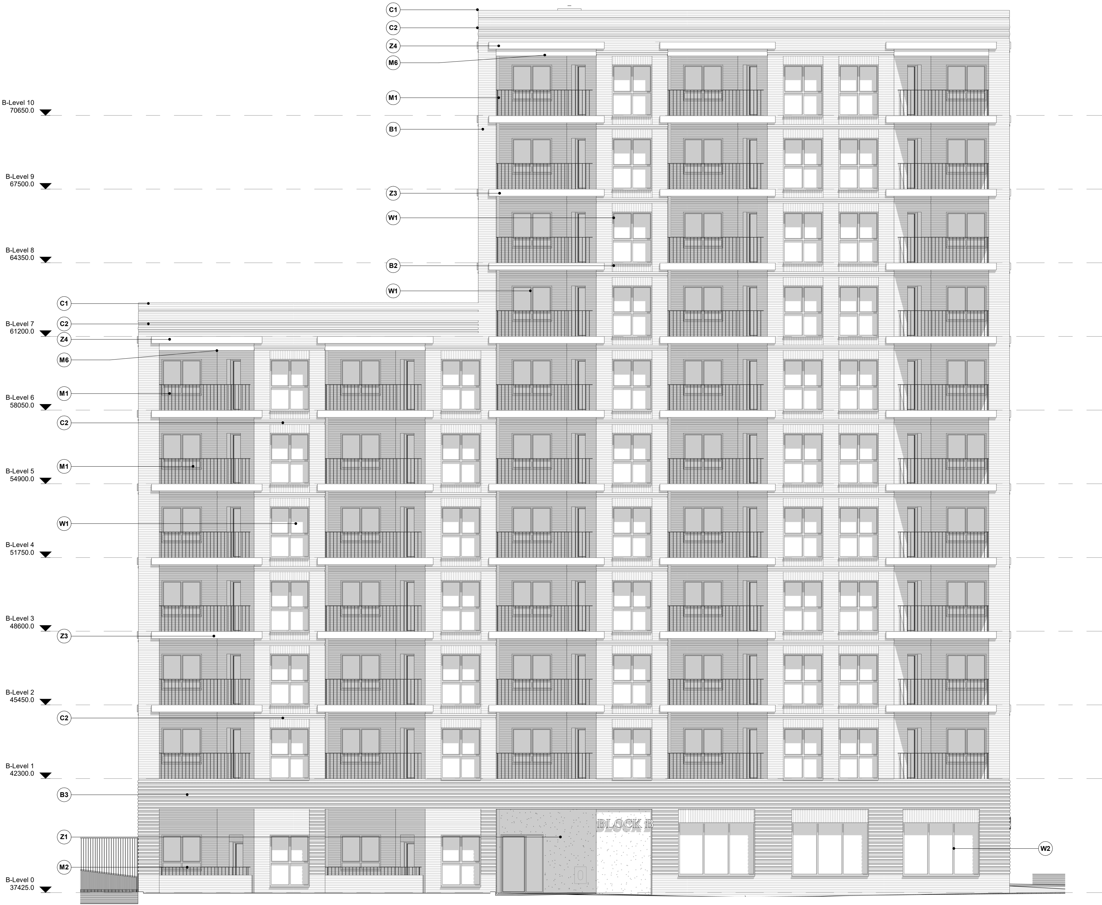
1 Block B - Front Elevation Scale: 1:100