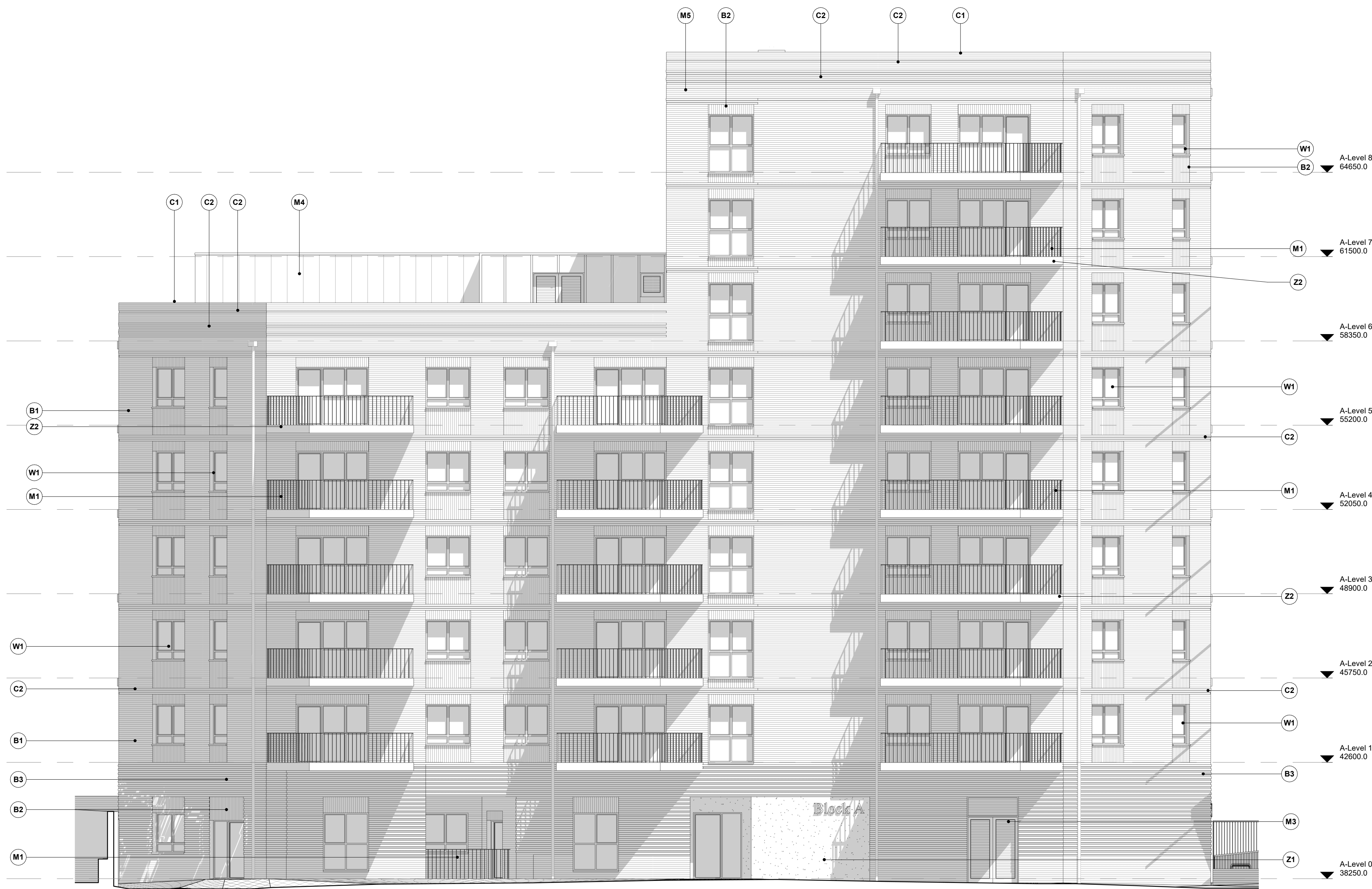
1 Block A - Rear Elevation Scale: 1:100

GENERAL NOTES: This drawing is © 2019 Pollard Thomas Edwards LLP (PTE). Use figured dimensions only. DO NOT SCALE. All dimensions are in millimetres unless noted otherwise. This drawing must be read in conjunction with all other relevant drawings and specifications from the Architect and other consultants. If in doubt, ask. SETTING OUT NOTES: All setting out to be confirmed on site prior to construction - any discrepancy must be immediately reported to the Architect. All setting out to face of structure or to grid. All partitions set out to studwork or structure. For setting out and specification of M&E services refer to M&E Consultants documents. For setting out and specification of structure refer to Structural Engineer's documents.