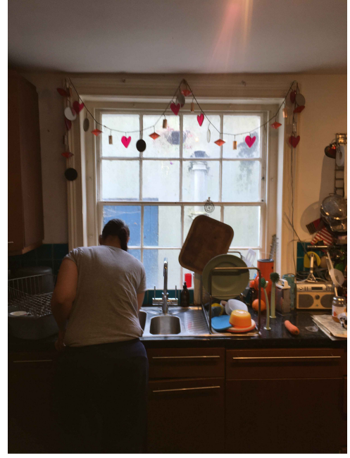
View looking towards existing window