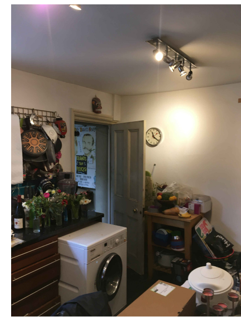
View looking towards existing cellar door