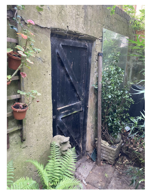
View towards garden door