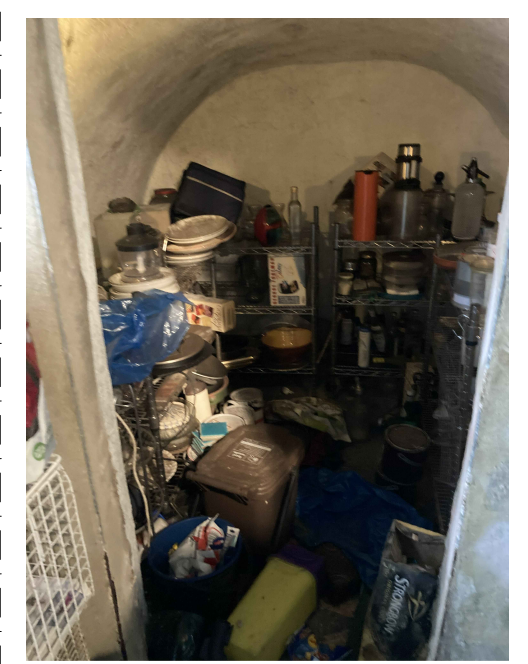
View looking into cellar