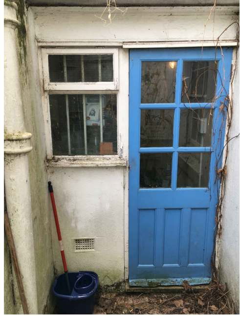
View looking towards external courtyard door and window