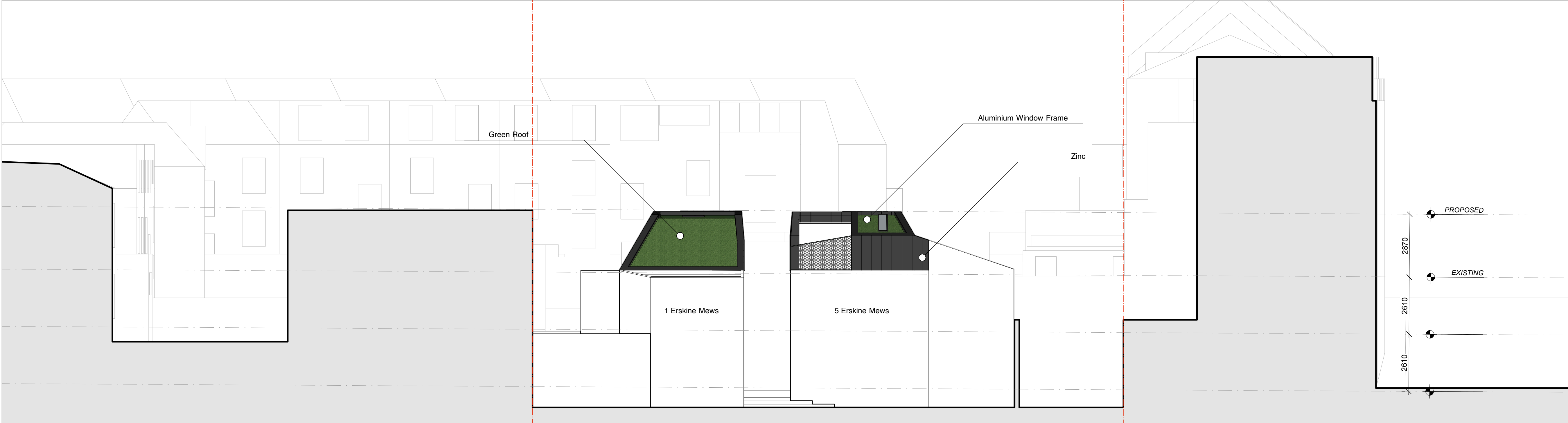
02 Proposed North Elevation GE.02 1:100 @ A1 | 1:200 @ A3

Information contained within this drawing is the sole copyright of 21st Architecture Ltd. and is not to be reproduced without express permission. No implied licence exists. This drawing not to be used for land transfer or valuation purposes. Do not scale from this drawing. All dimensions & levels are to be checked on site by the contractor. Issued for purposes indicated only. Drawing errors and omissions to be reported to the architect.