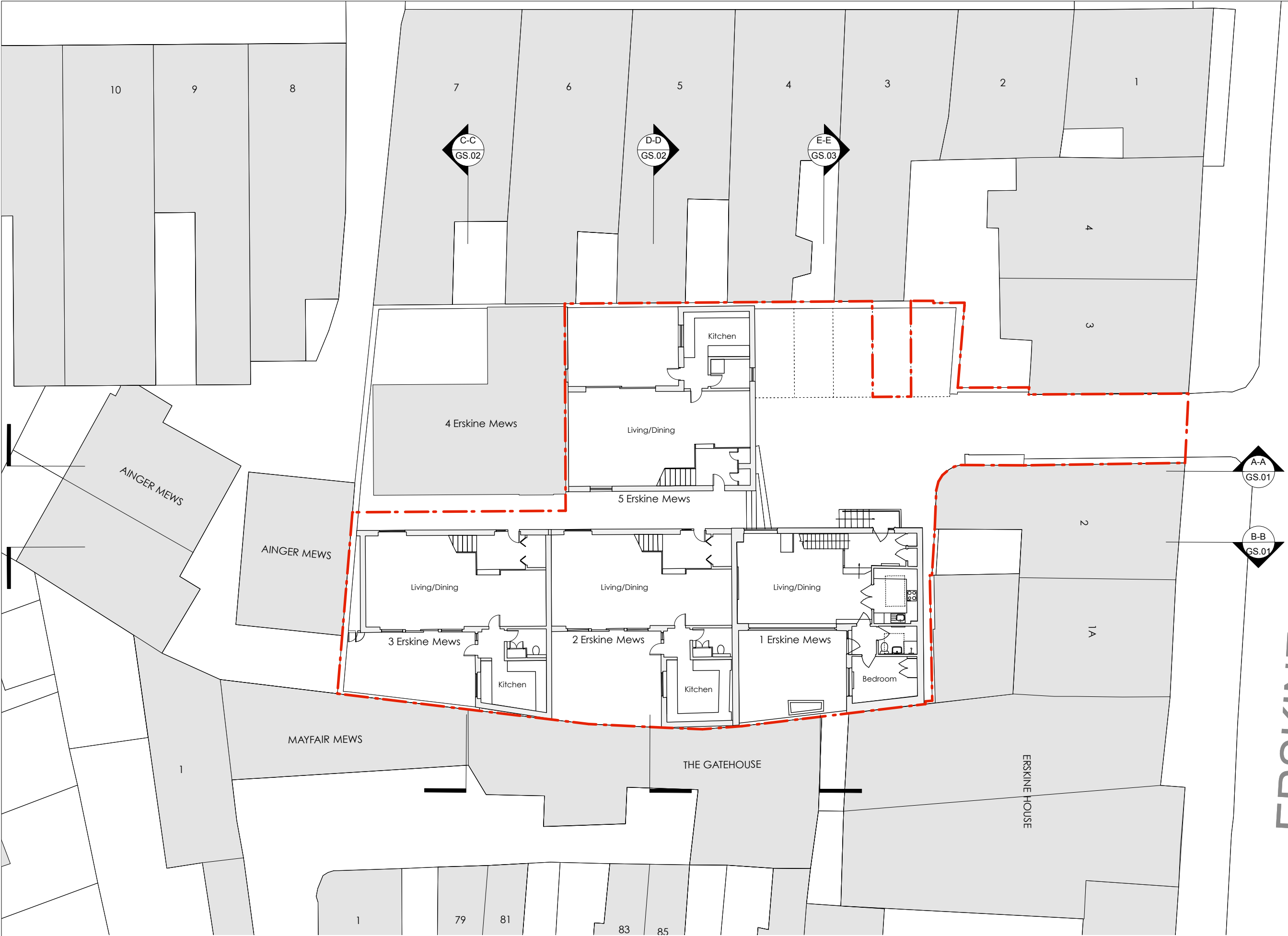
00 Proposed Ground Floor Plan 1:200 @ A3