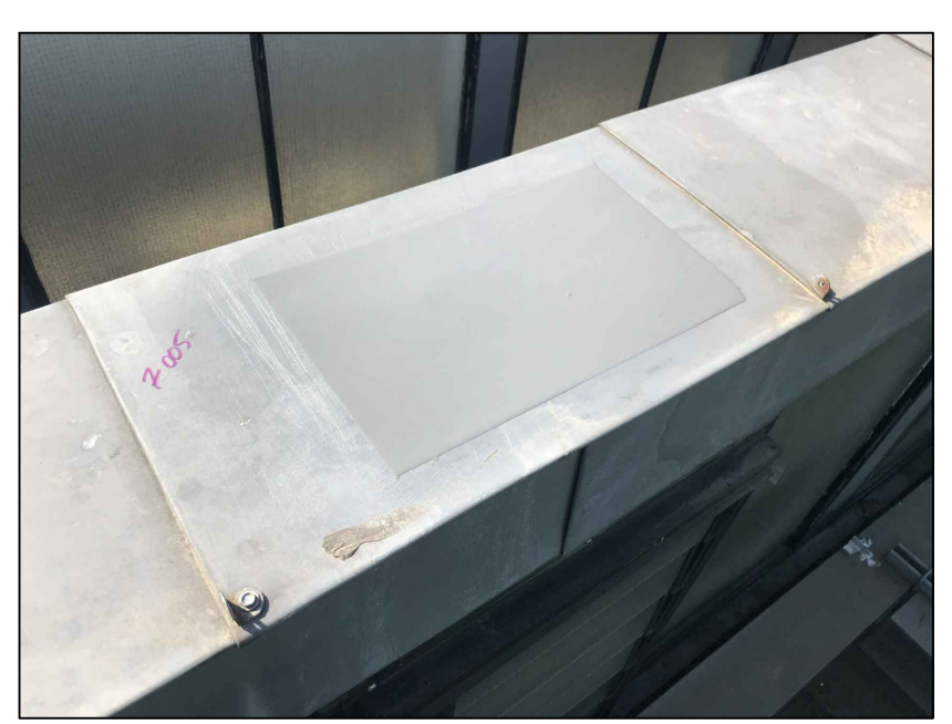
Liquid coating to Zinc Cladding RAL Colour 7005/ Mouse Grey (closest match to existing)