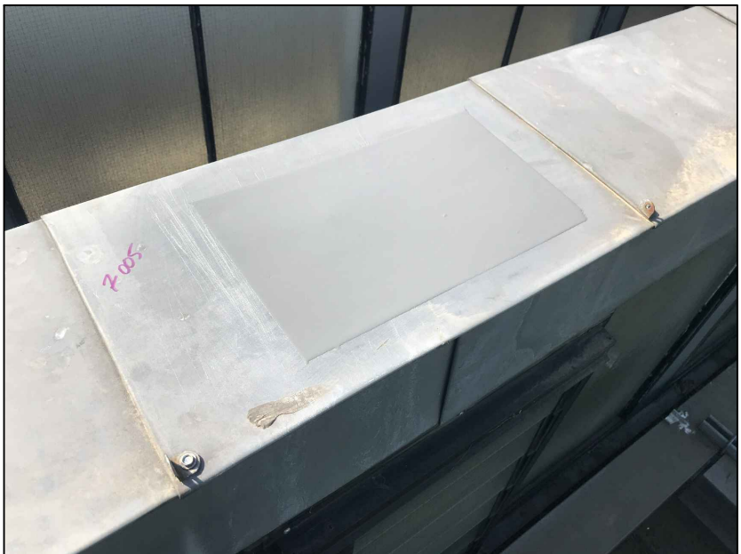
Liquid coating to Zinc Cladding RAL Colour 7005/ Mouse Grey (closest match to existing)