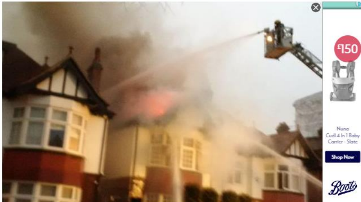
Firefighters attended the fire in Antrim Grove on Sunday morning

Published: 3:34 PM March 13, 2016 Updated: 1:47 PM October 14, 2020