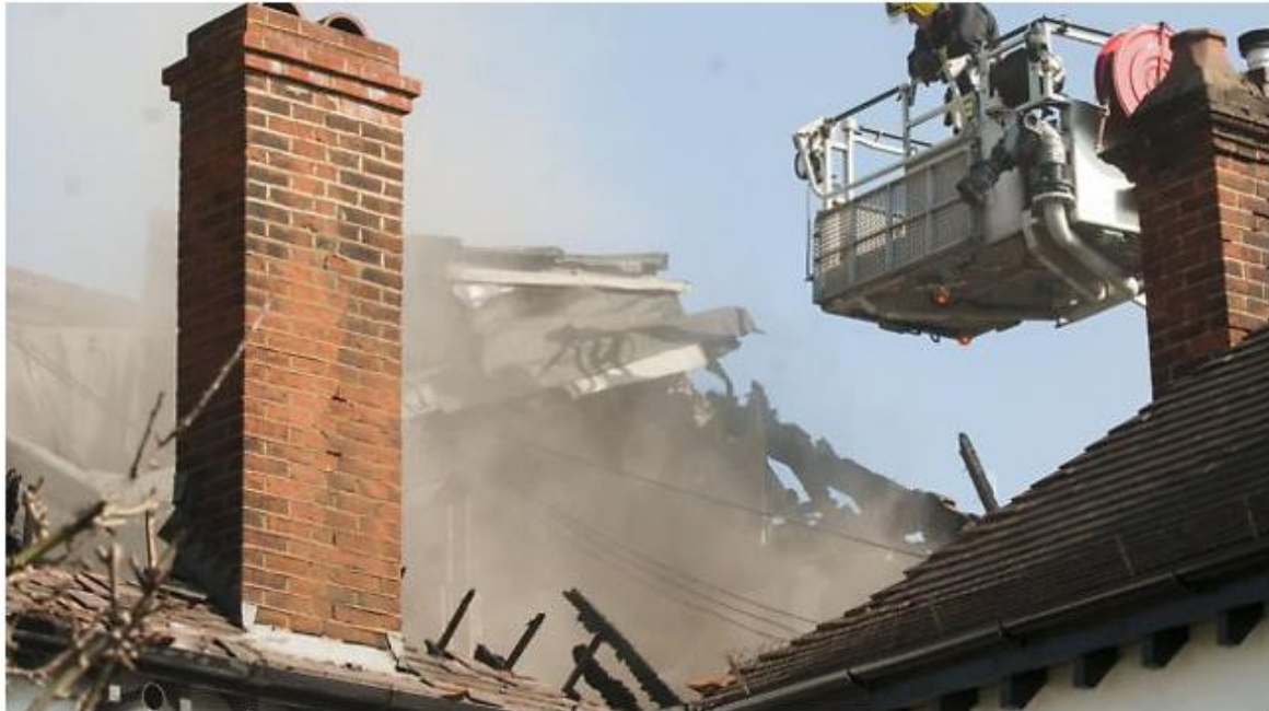
Firefighters in Antrim Grove early on Sunday Morning

Ten fire engines and 72 firefighters were engaged in tackling a serious house fire in Belsize Park this morning.