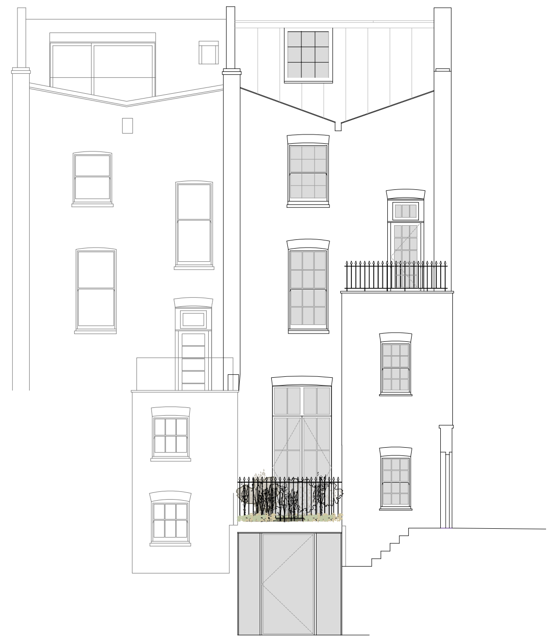
2/ REAR ELEVATION - PROPOSED