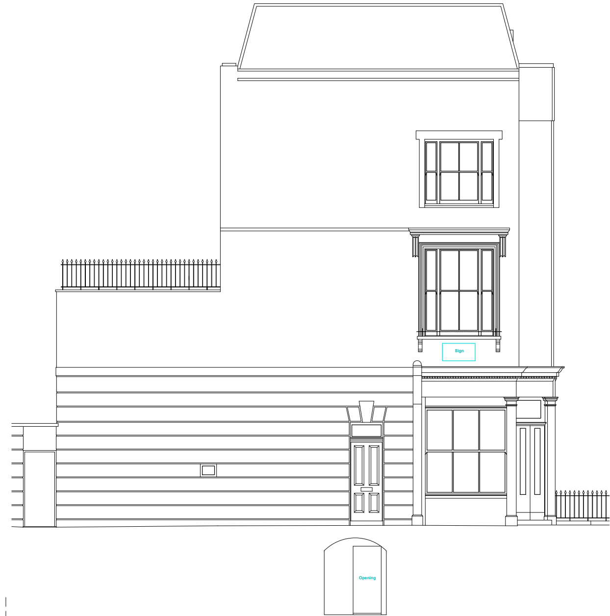
1/ REAR ELEVATION - EXISTING