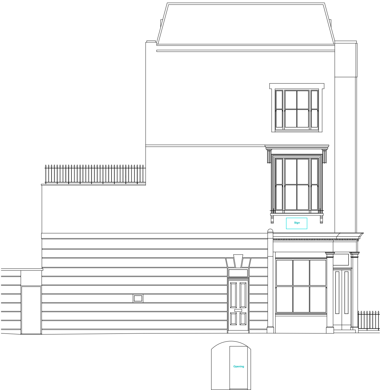
2/ REAR ELEVATION - PROPOSED