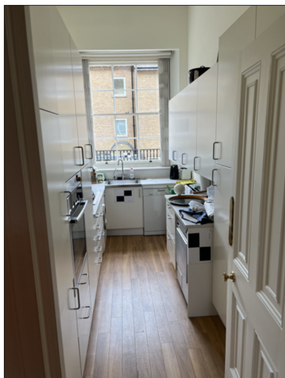
strip out existing kitchen units, appliances and floor finish

THIS DRAWING IS THE PROPERTY OF KERR PARKER ASSOCIATES LTD AND MAY NOT BE REPRODUCED OR DISCLOSED TO A THIRD PARTY IN ANY FORM WITHOUT WRITTEN PERMISSION.