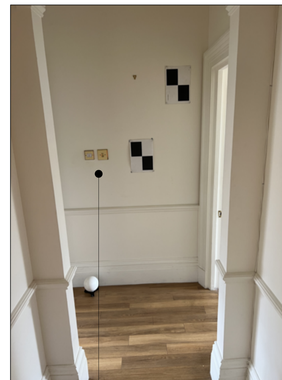
replace switch and socket plates throughout