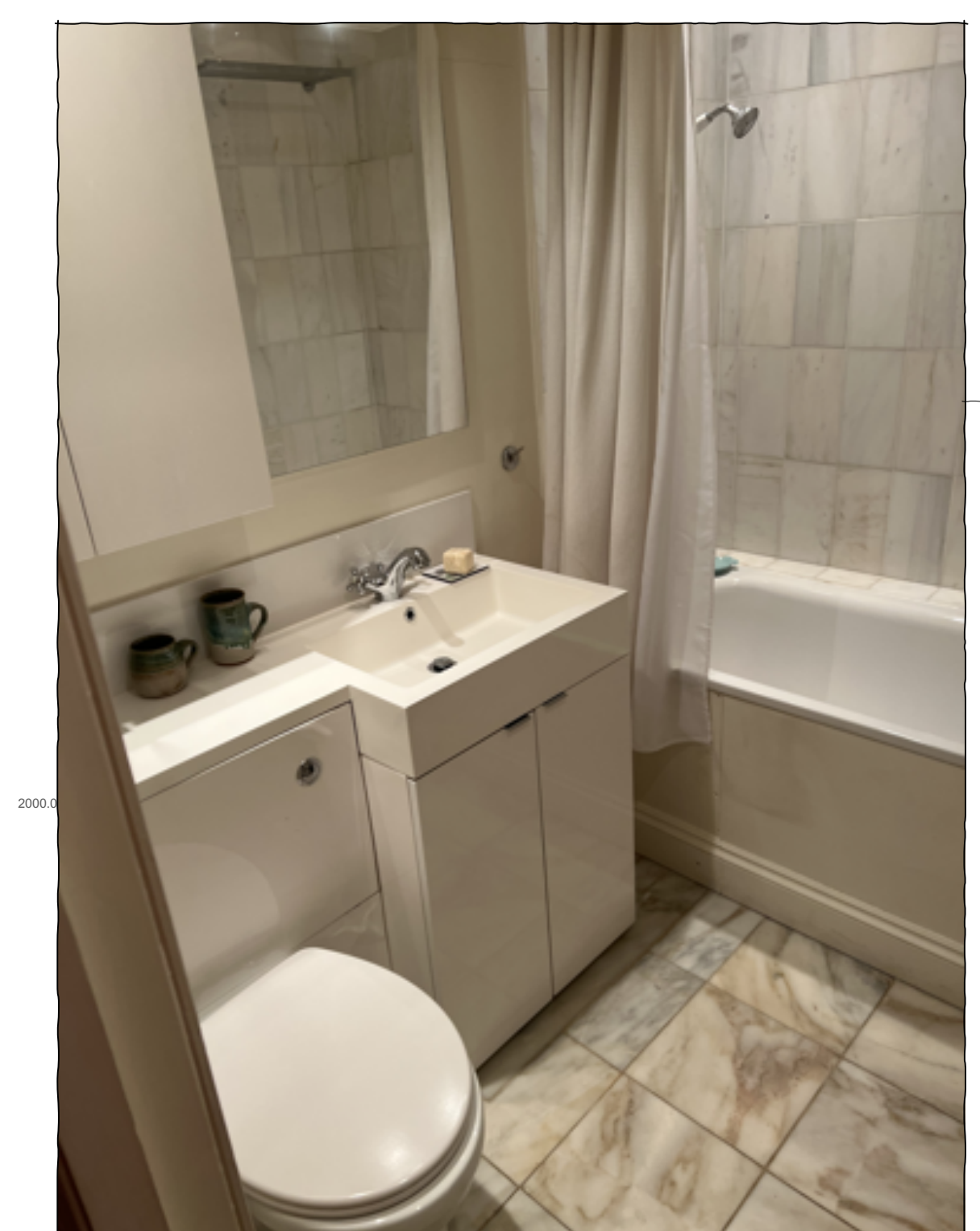
strip out existing sanitaryware, floor and wall tiles