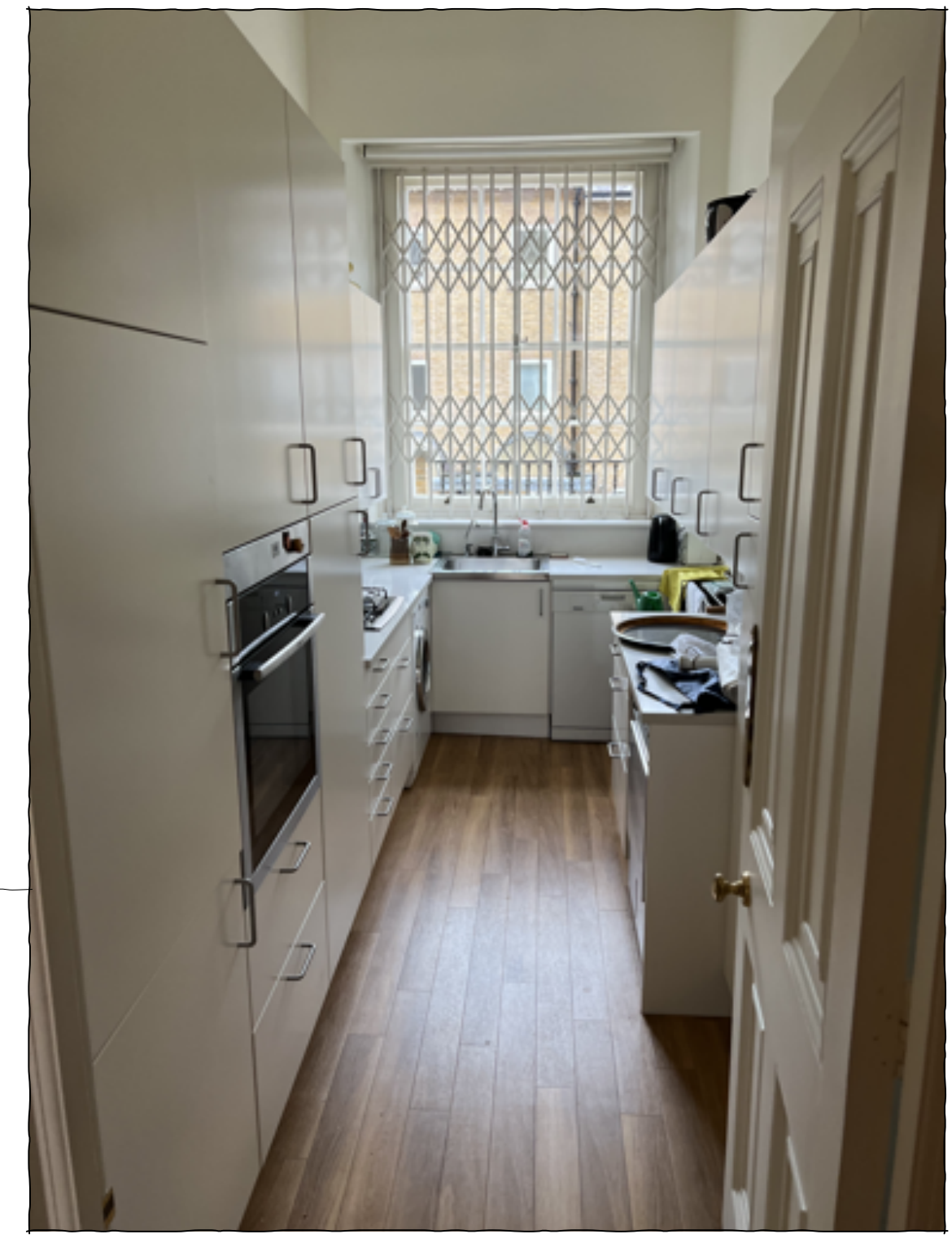
strip out existing kitchen units appliances and floor finish form new opening to wall between kitchen and bedroom 2, refer to structural engineers details