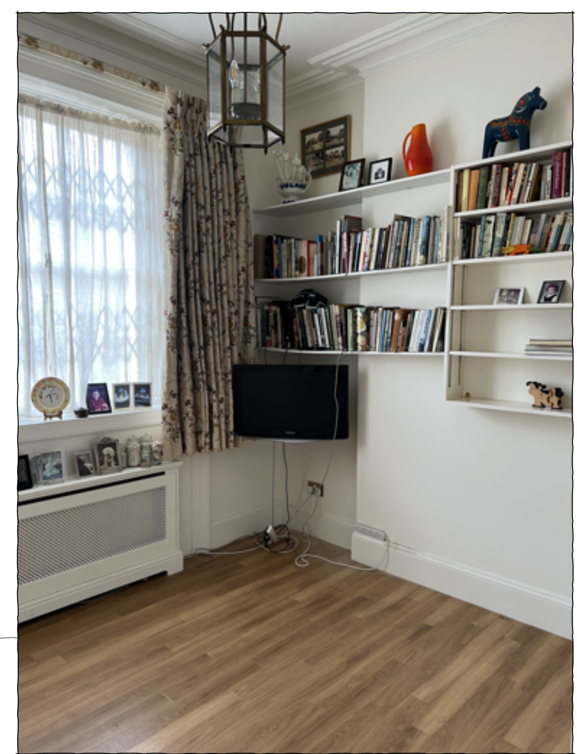
replace floor finish on acoustic mat