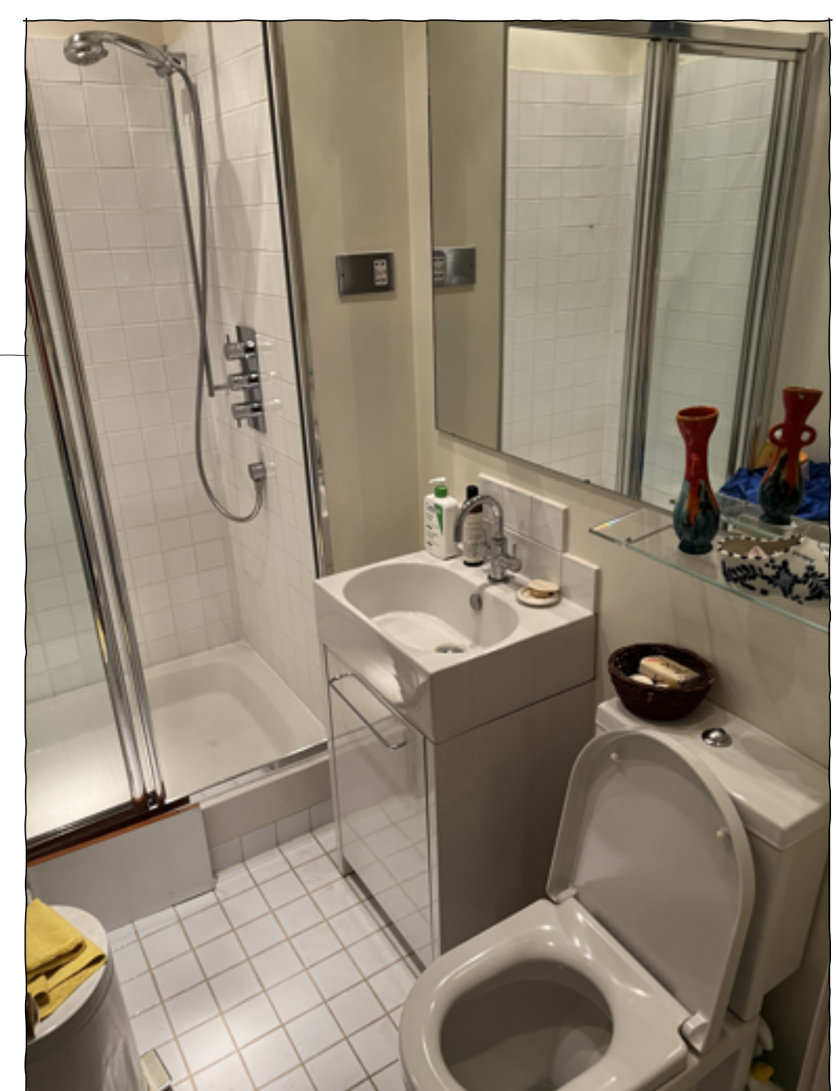
strip out existing sanitaryware, floor and wall tiles