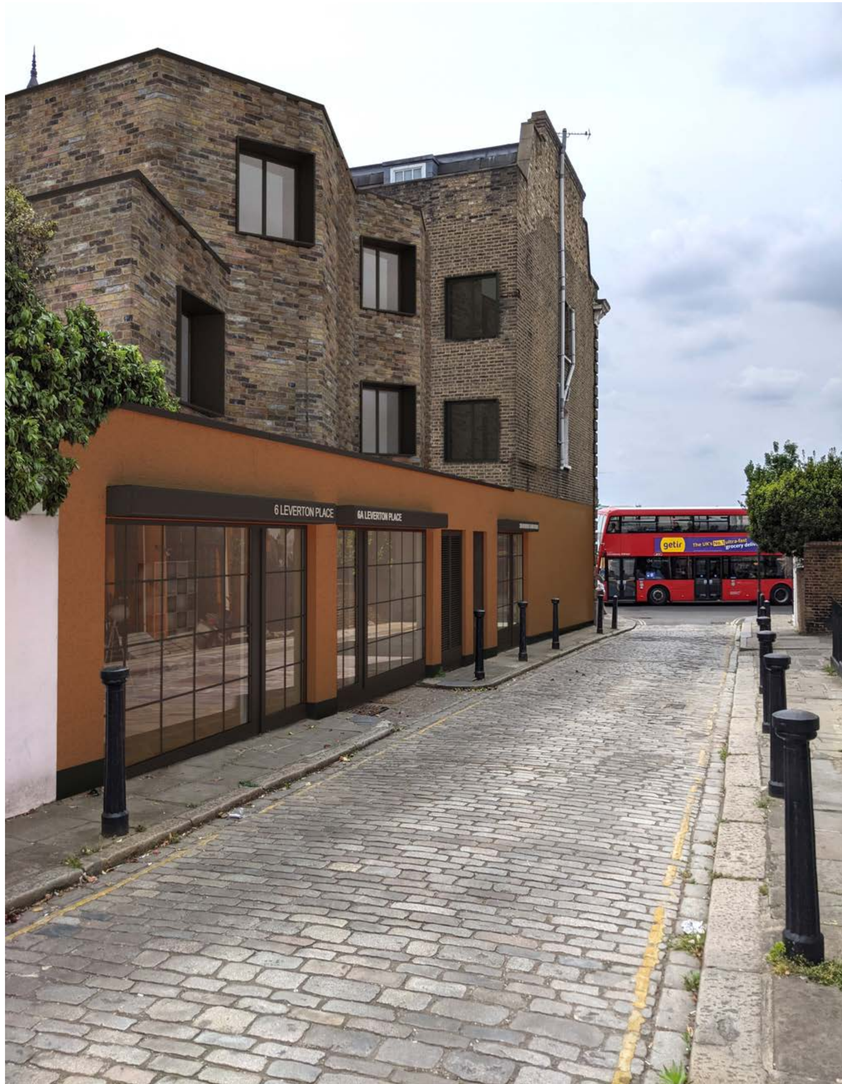
View from Leverton Place