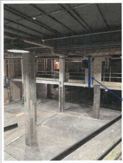
DUCTWORK TO DROP DOWN COLUMN FROM HIGH LEVEL TO SERVE OPEN PLAN AREA