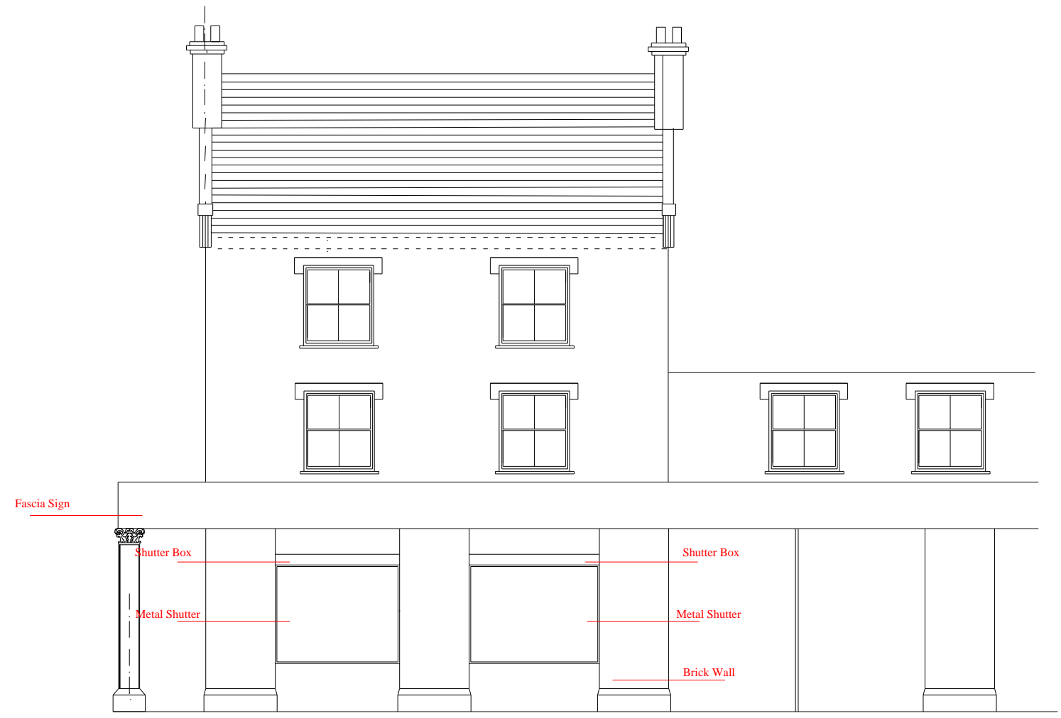
Gordon House Road Elevations