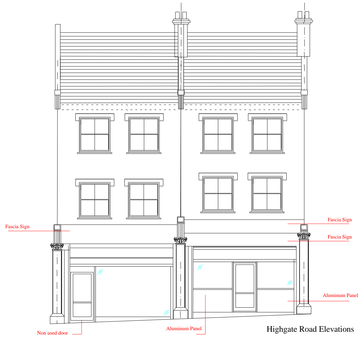
Highgate Road Elevations