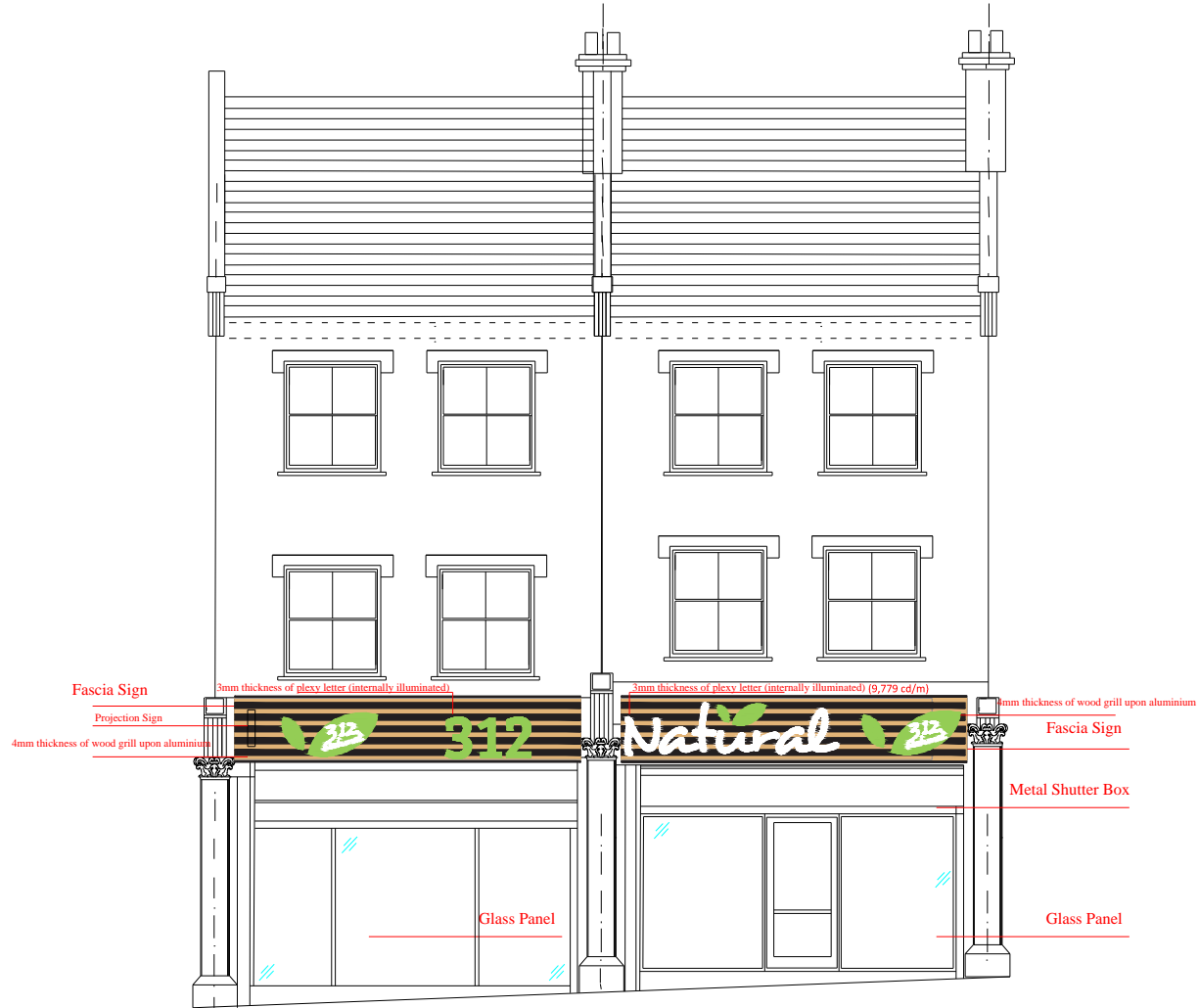
High Gate Road Elevations