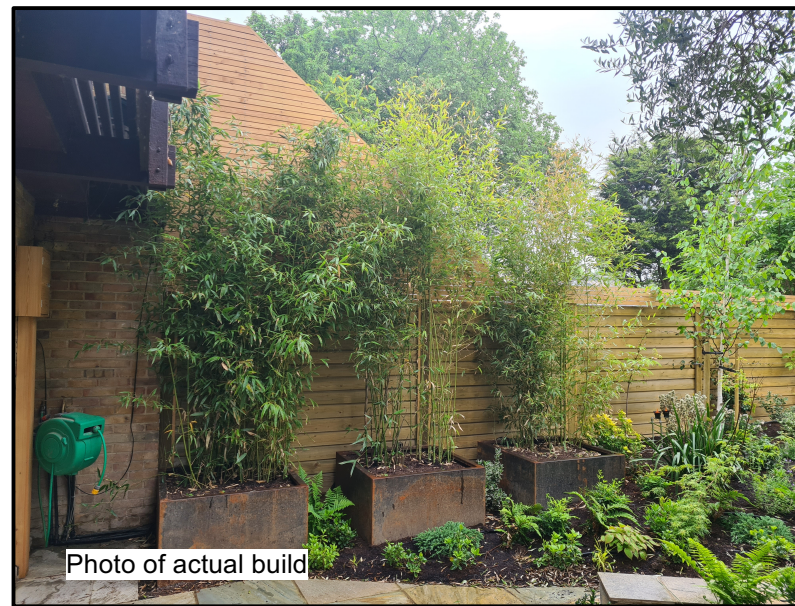
Photo of actual build

Report all errors and omissions to the designer immediately.