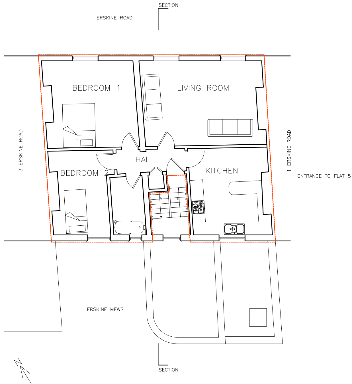
EXISTING THIRD FLOOR PLAN