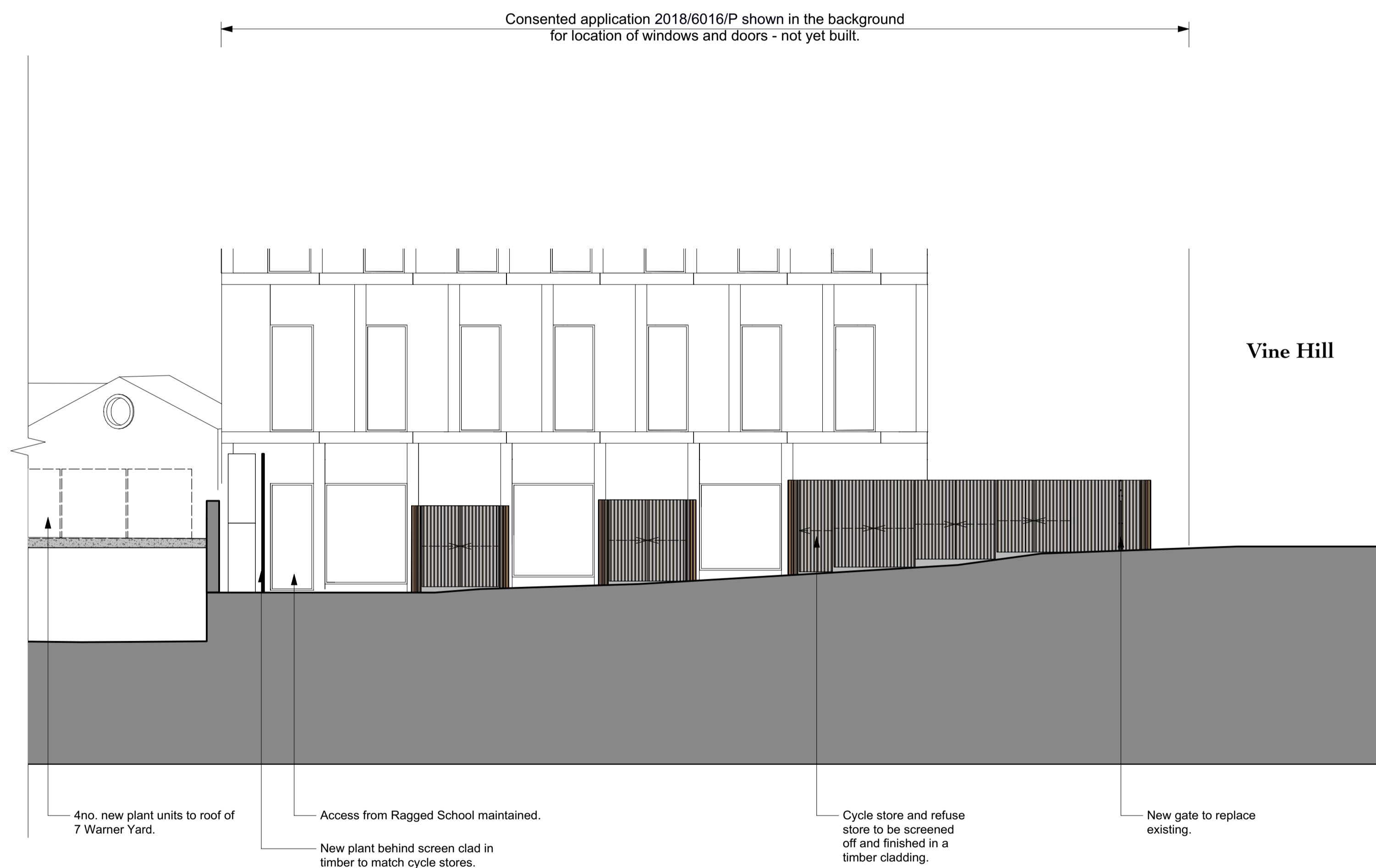
1 Proposed Elevation - West (Courtyard) Scale: 1:100