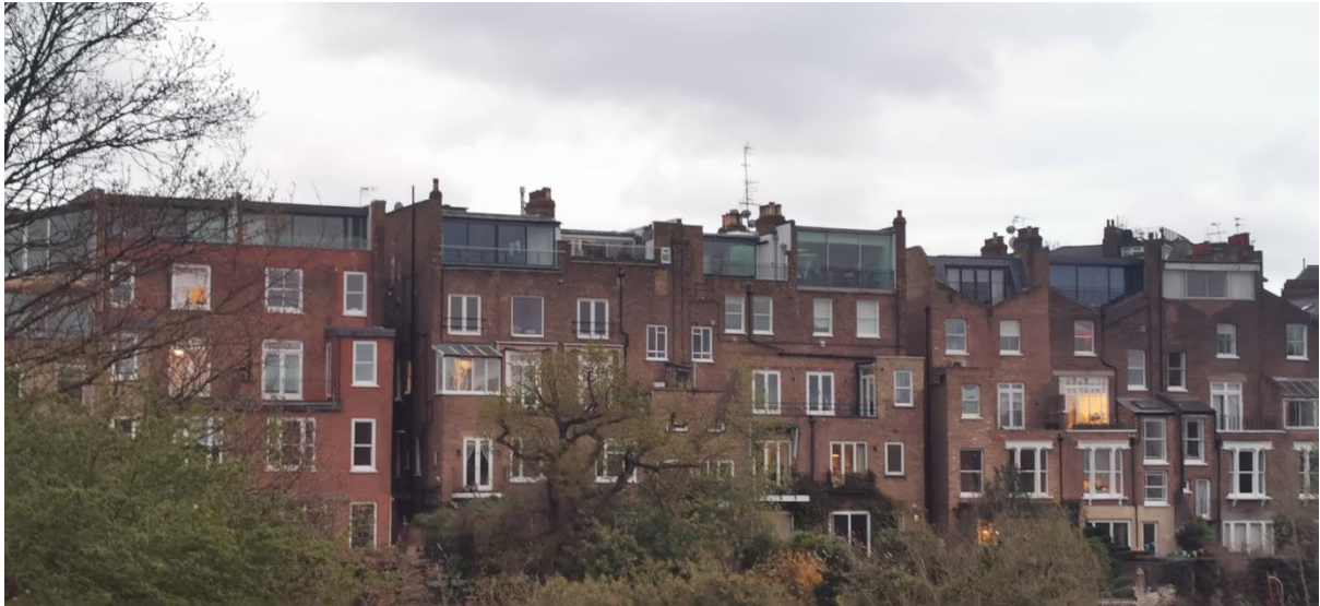
South Hill Park Road (facing onto the Heath)