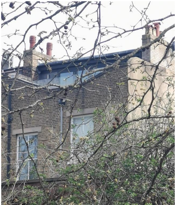
24 South Park Hill