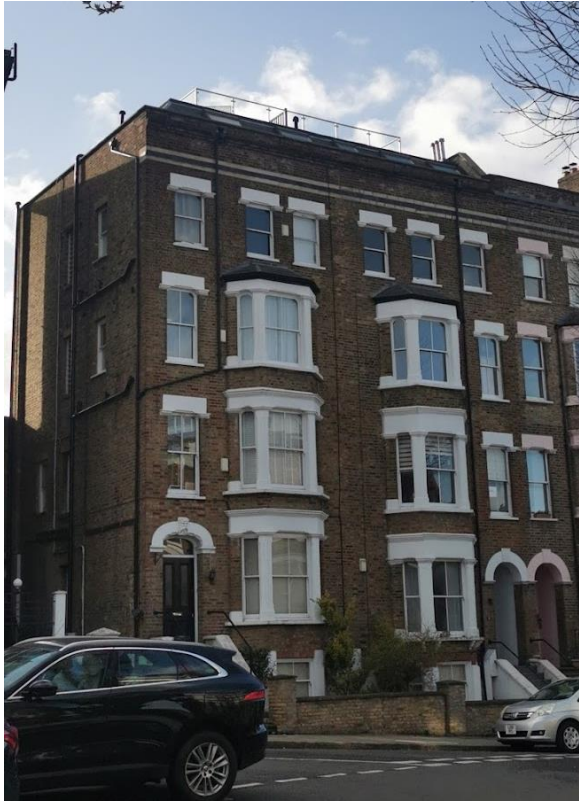
41-43 South Park Hill