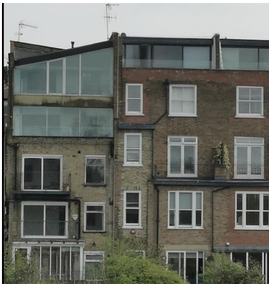
72-76 South Hill Park Gardens