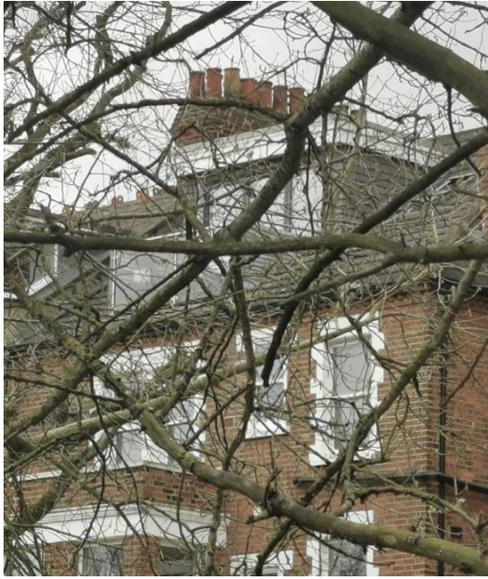
20 Tanza Road