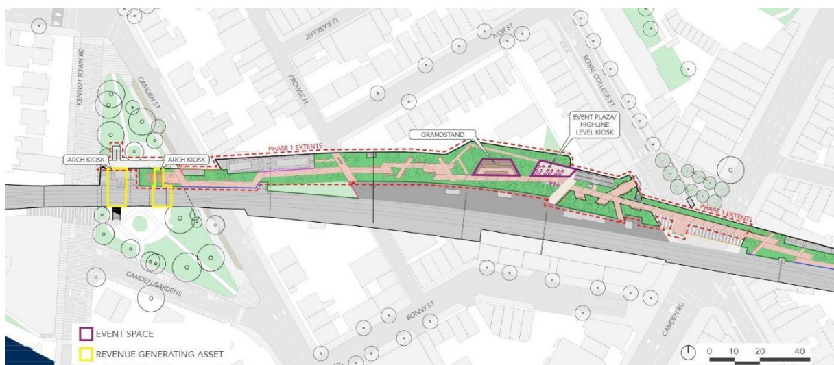
Fig 5: Camden Highline Grandstand and Events Space /Kiosk.

The Camden Highline will host events, organised both by the Highline itself and through rental of the space by outside parties. Some events can take place without closing the park, and others will take place after normal closing times. The Highline will also occasionally close to the public entirely for ticketed or private events; these closures will not exceed 10 days a year. These events will take place in two dedicated locations: the Grandstand and the Events Space (See Figure 5.). Events will not continue past 10:30 pm.