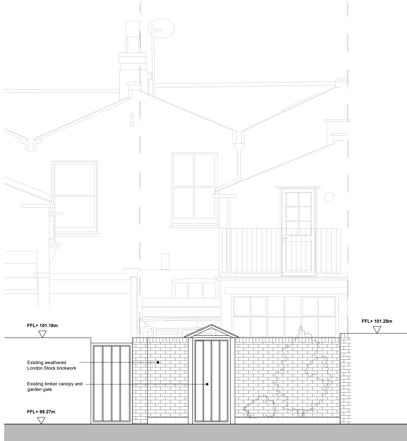
ELEVATION OF BOUNDARY WALL FACING HAMPSTEAD WAY