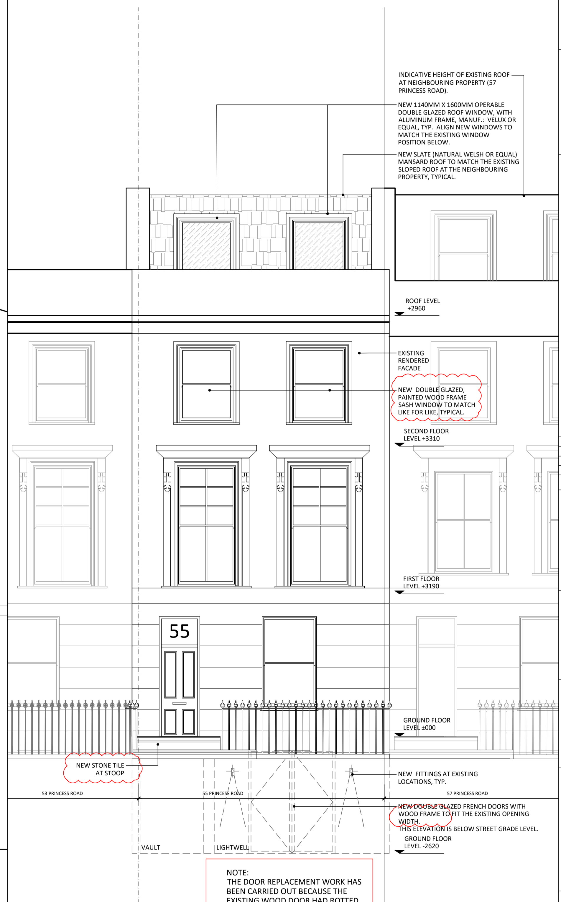
03 APPROVED STREET ELEVATION A-10 1:50 @ A1

NOTE: THE DOOR REPLACEMENT WORK HAS BEEN CARRIED OUT BECAUSE THE EXISTING WOOD DOOR HAD ROTTED OUT AND WAS COMPROMISED. THE NEW DOOR HAS AN ALUMINUM FRAME BECAUSE OF DAMP CONCERNS. PLEASE SEE THE REVISED DESIGN AND ACCESS STATEMENT SUBMITTED WITH THE DRAWINGS FOR FURTHER INFORMATION.