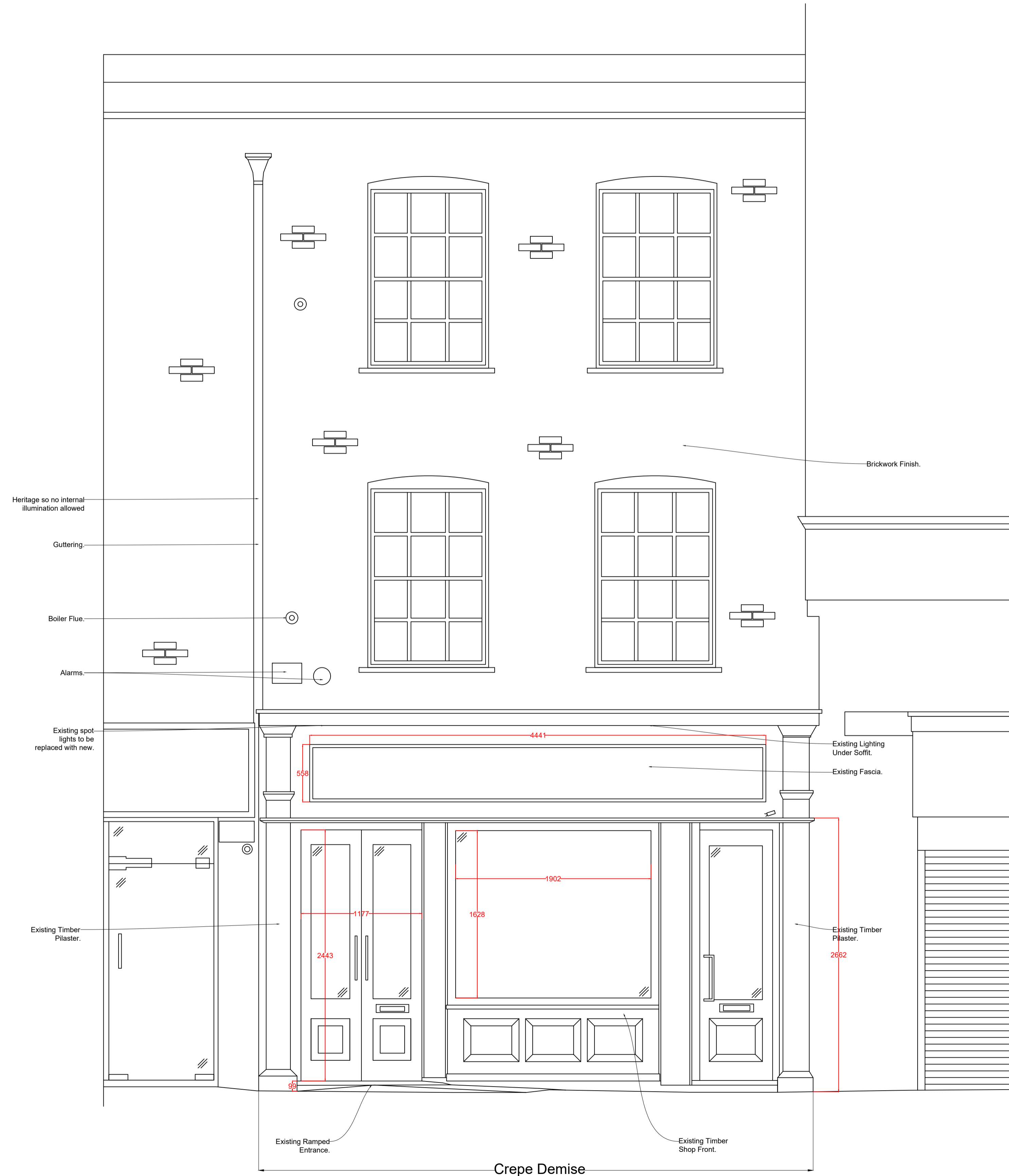
Existing Front Elevation Scale 1:25 @ A1

GENERAL NOTES 1. ALL WORKS WITHIN THIS DOCUMENT TO BE INSTALLED/CARRIED OUT IN COMPLIANCE WITH THE LATEST BUILDING REGULATIONS AND BRITISH STANDARDS. 2. CONTRACTOR TO CHECK AND VERIFY ALL ON-SITE DIMENSIONS PRIOR TO MANUFACTURE/INSTALLATION AND MUST REPORT ANY DISCREPANCIES BACK TO RETAIL DESIGN SOLUTIONS. FAILURE TO DO SO WILL BE AT THE CONTRACTOR'S EXPENSE. 3. THIS DRAWING MUST NOT BE SCALED. WORK TO DIMENSIONS ONLY. 4. ANY CONSTRUCTION/WORKING DRAWINGS IN THIS DOCUMENT ARE INDICATIVE ONLY. IT IS THE RESPONSIBILITY OF THE CONTRACTOR TO ENSURE THEY ARE FIT FOR PURPOSE, AND TO MAKE AMENDMENTS WHERE NECESSARY PRIOR TO INSTALLATION. 5. THE CONTENTS OF THIS DOCUMENT ARE THE PROPERTY OF RETAIL DESIGN SOLUTIONS. IT IS NOT TO BE COPIED OR DISTRIBUTED IN WHOLE OR PART WITHOUT FORMAL CONSENT.