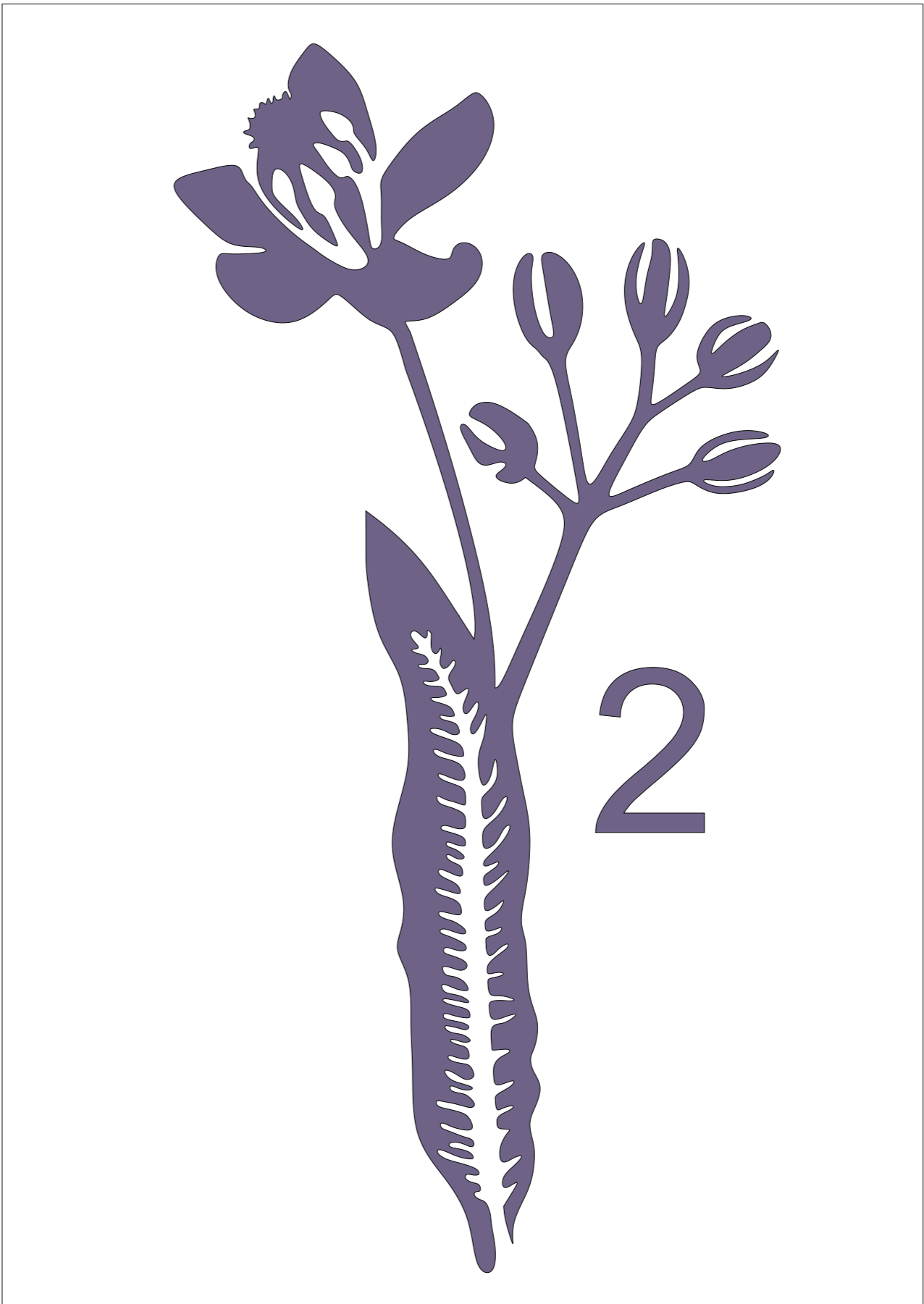
Stencil position 2