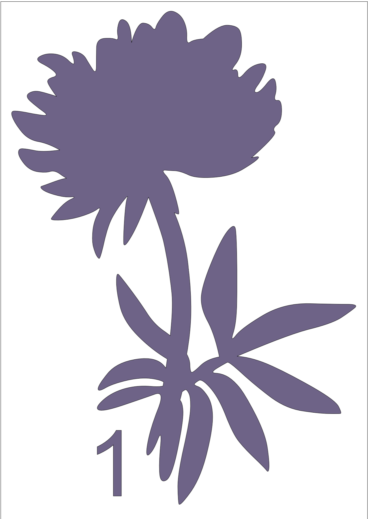
Stencil position 1