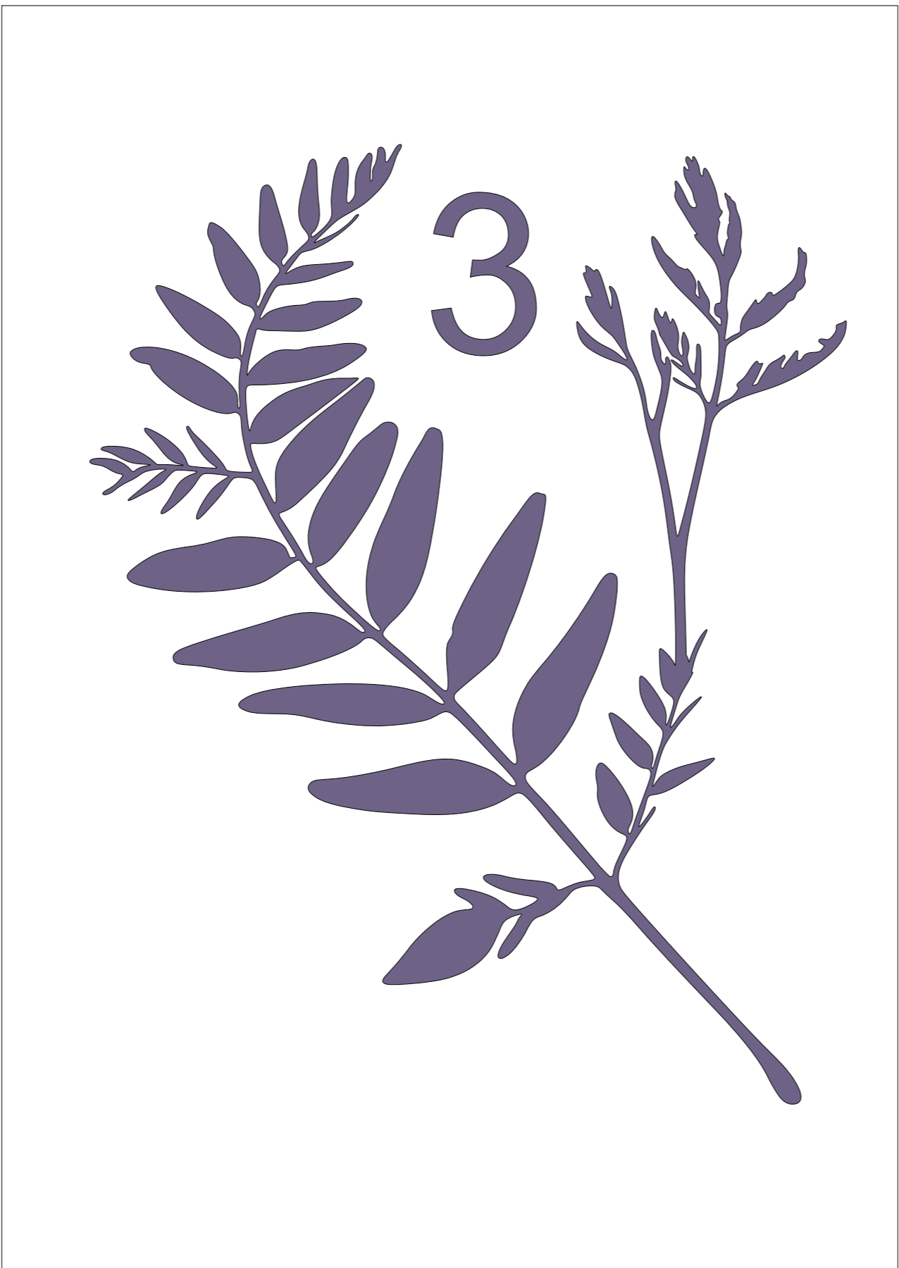
Stencil position 3