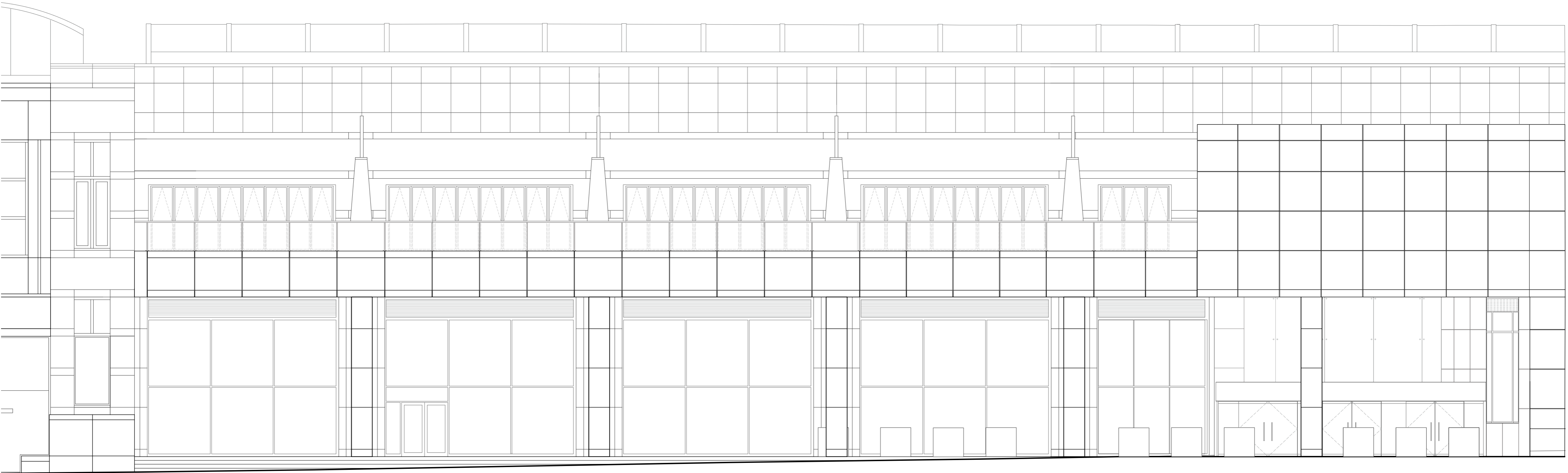
Finchley Road Elevation

General Notes: © East Architecture landscape urban design limited. Do not scale off drawing. Check all dimensions on site and advise any discrepancies before commencing work. All dimensions in millimetres unless otherwise noted.