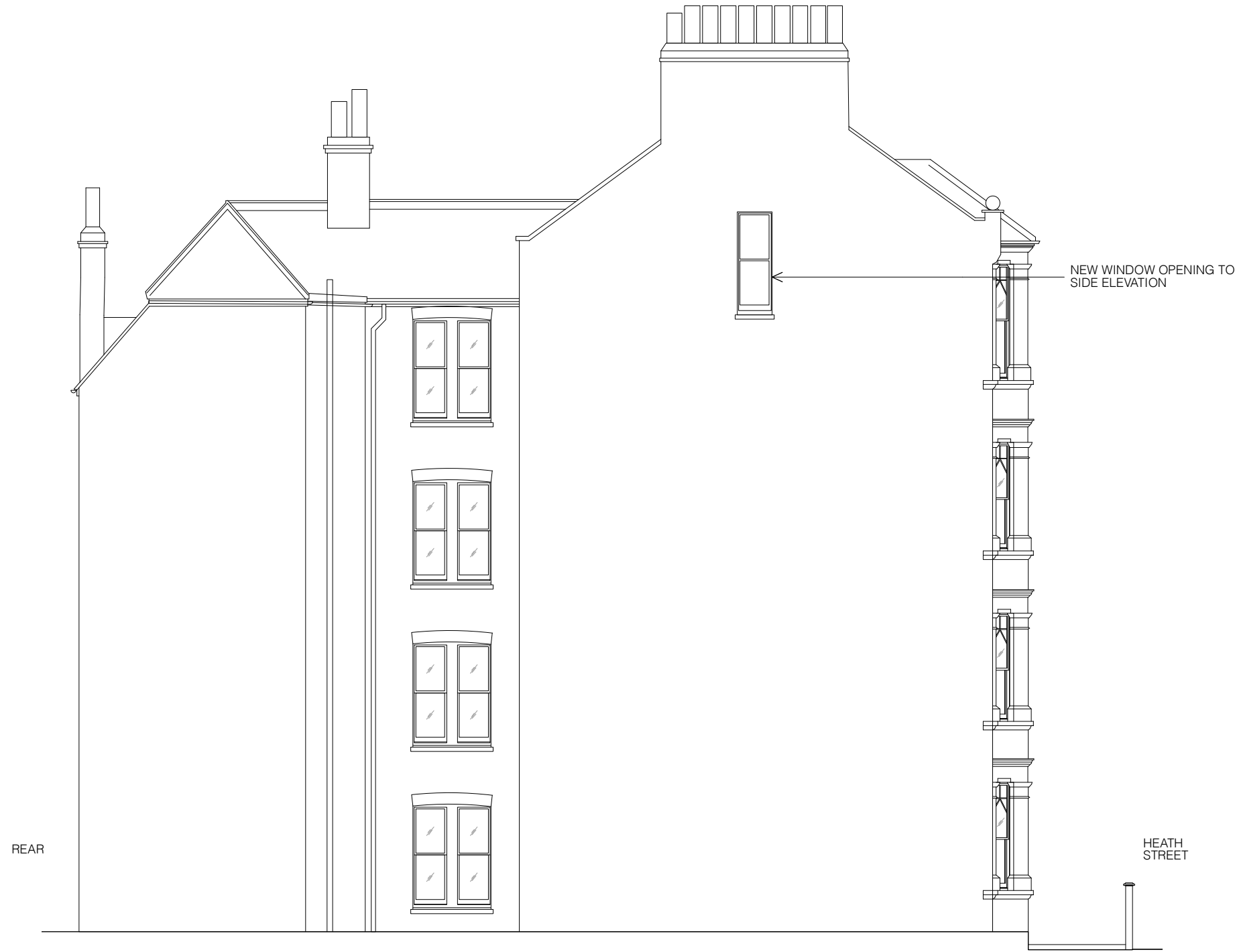
N External Elevation (North) Scale: 1:100