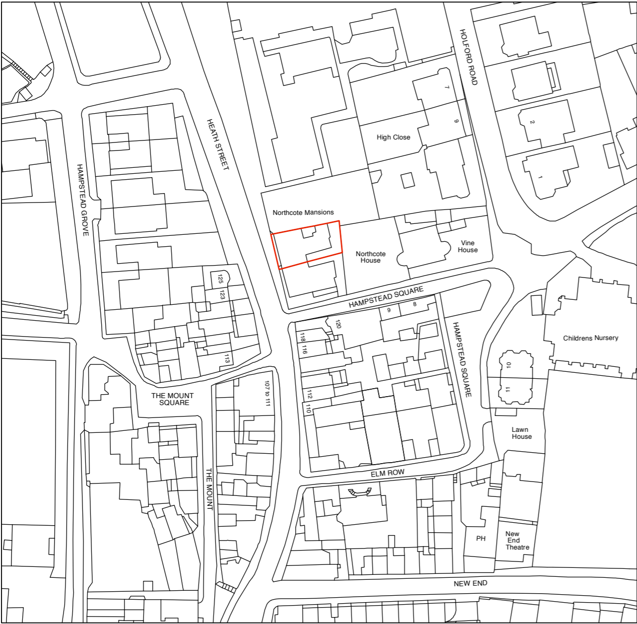
LP Location Plan Scale: 1:1250