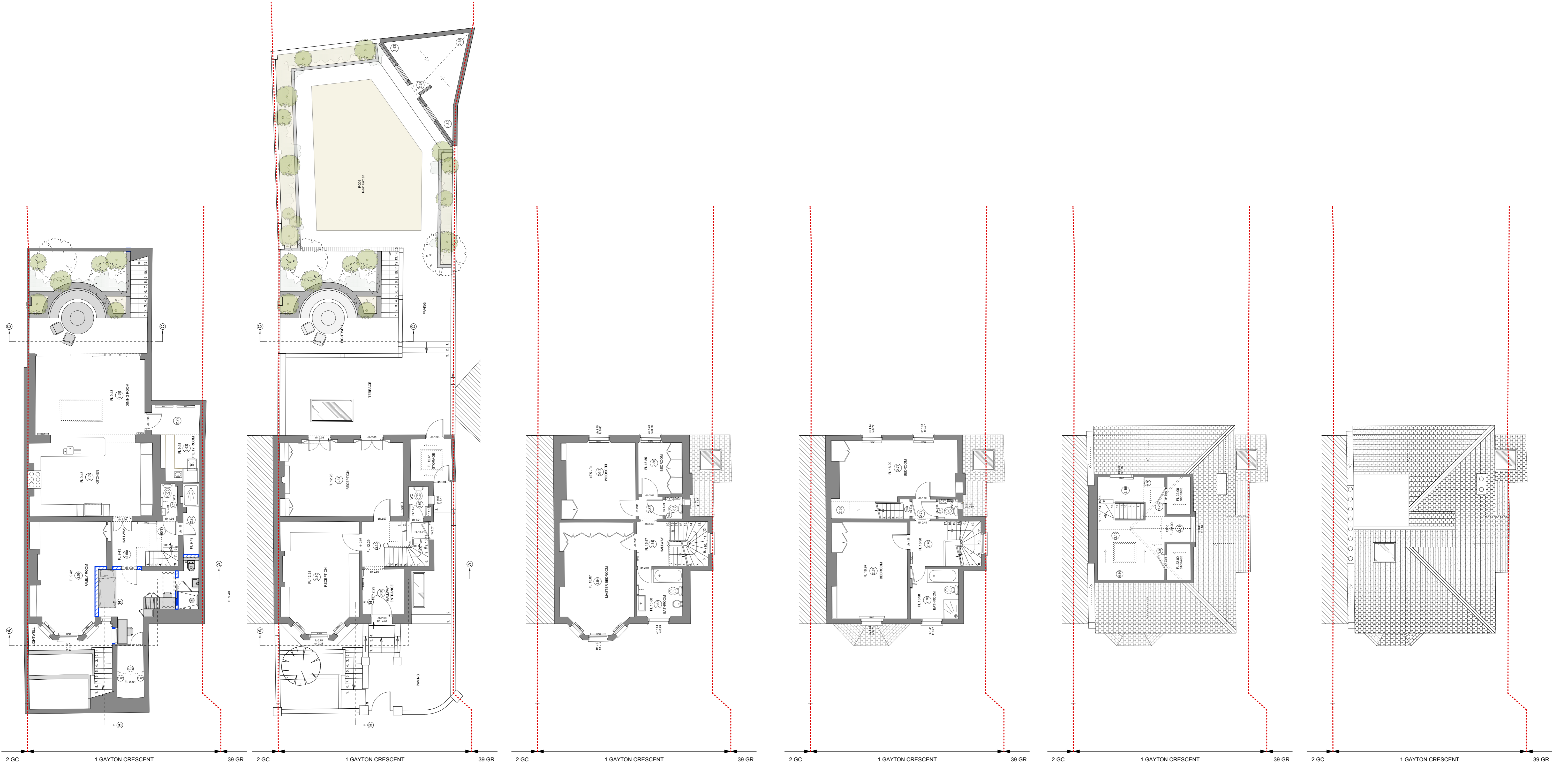
PROPOSED LOWER GROUND FLOOR PLAN