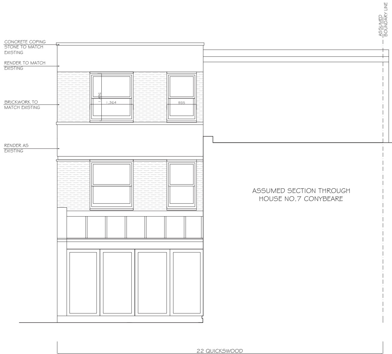
ASSUMED SECTION THROUGH HOUSE NO.7 CONYBEARE