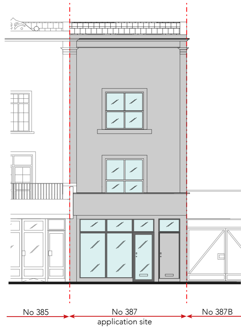
Proposed Front Elevation (A)