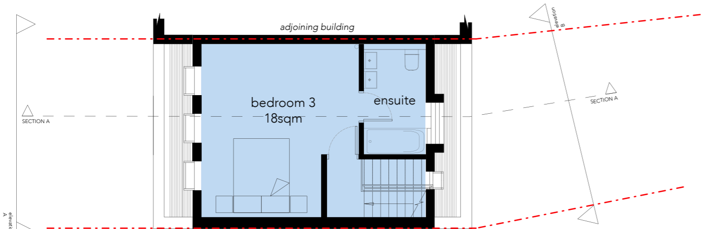
Existing Third Floor Plan