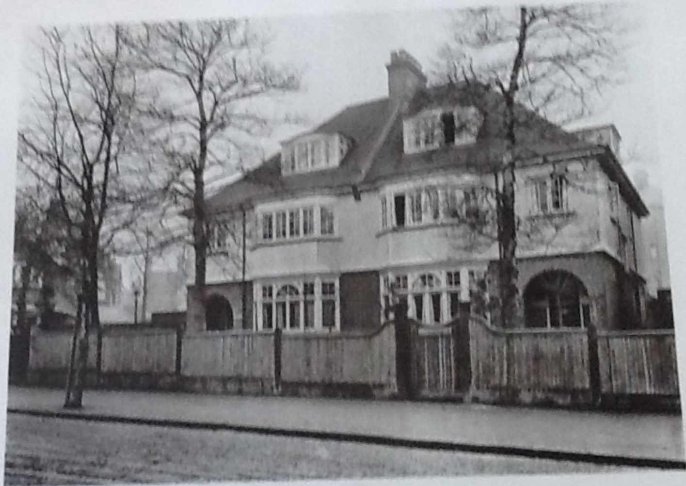
TYPE No. 1. FRONT VIEW