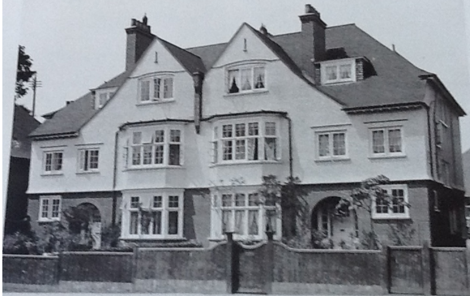
TYPE No. V. FRONT VIEW.