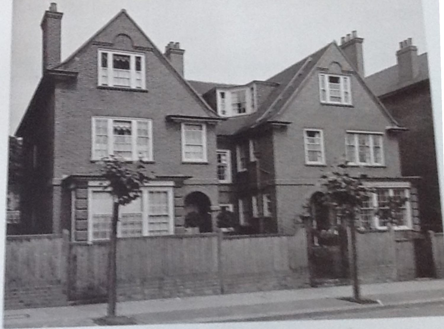
Simplest, English House