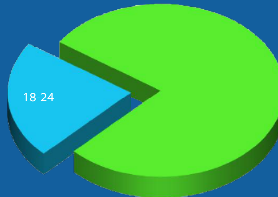
Staff between the age of 18 & 24