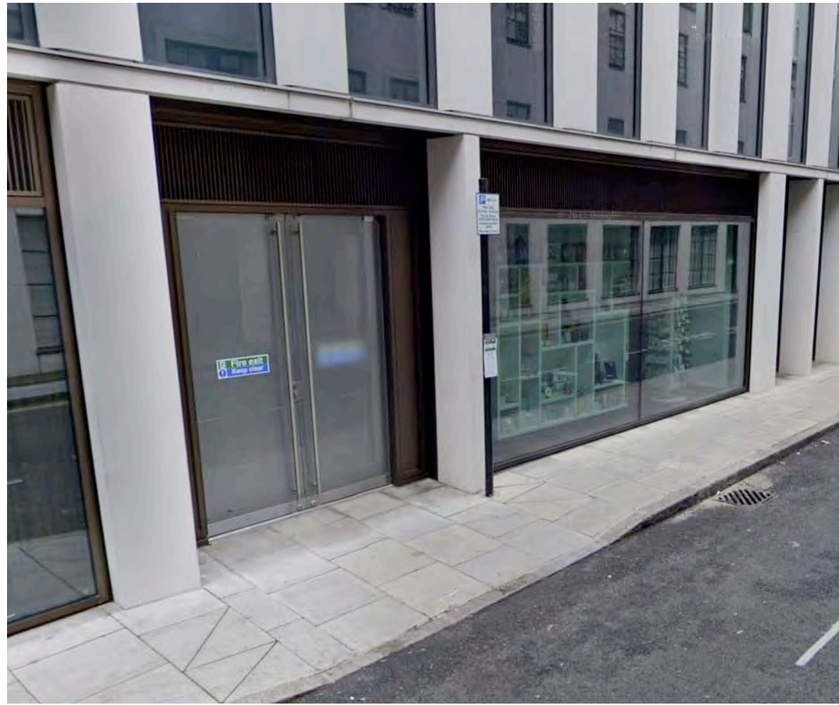
Existing Photograph NTS