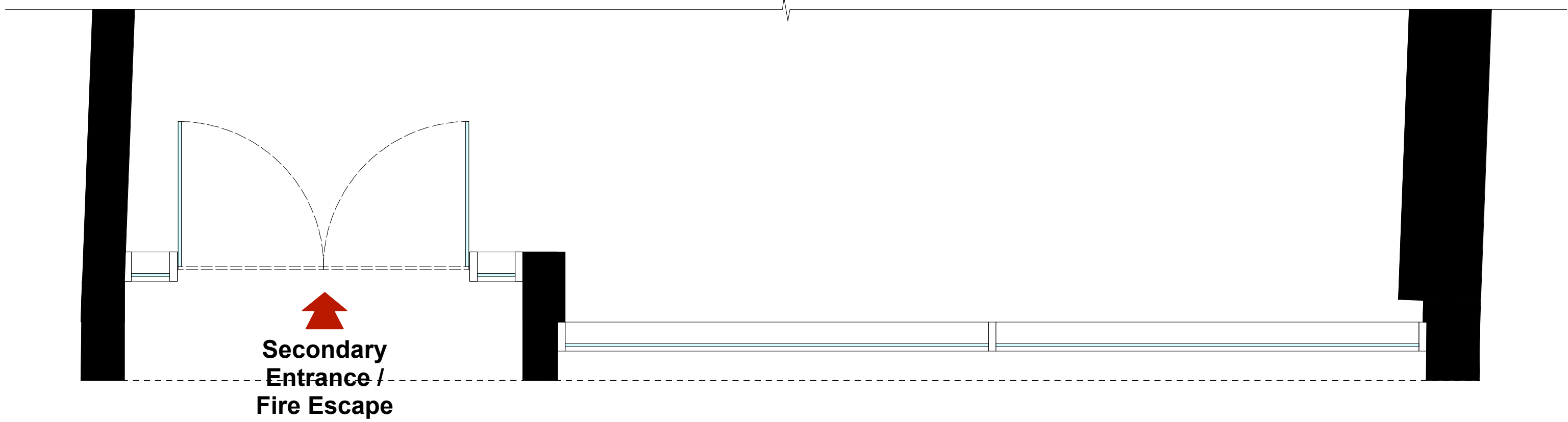
Existing Shopfront Part Plan Scale 1:25 @ A1