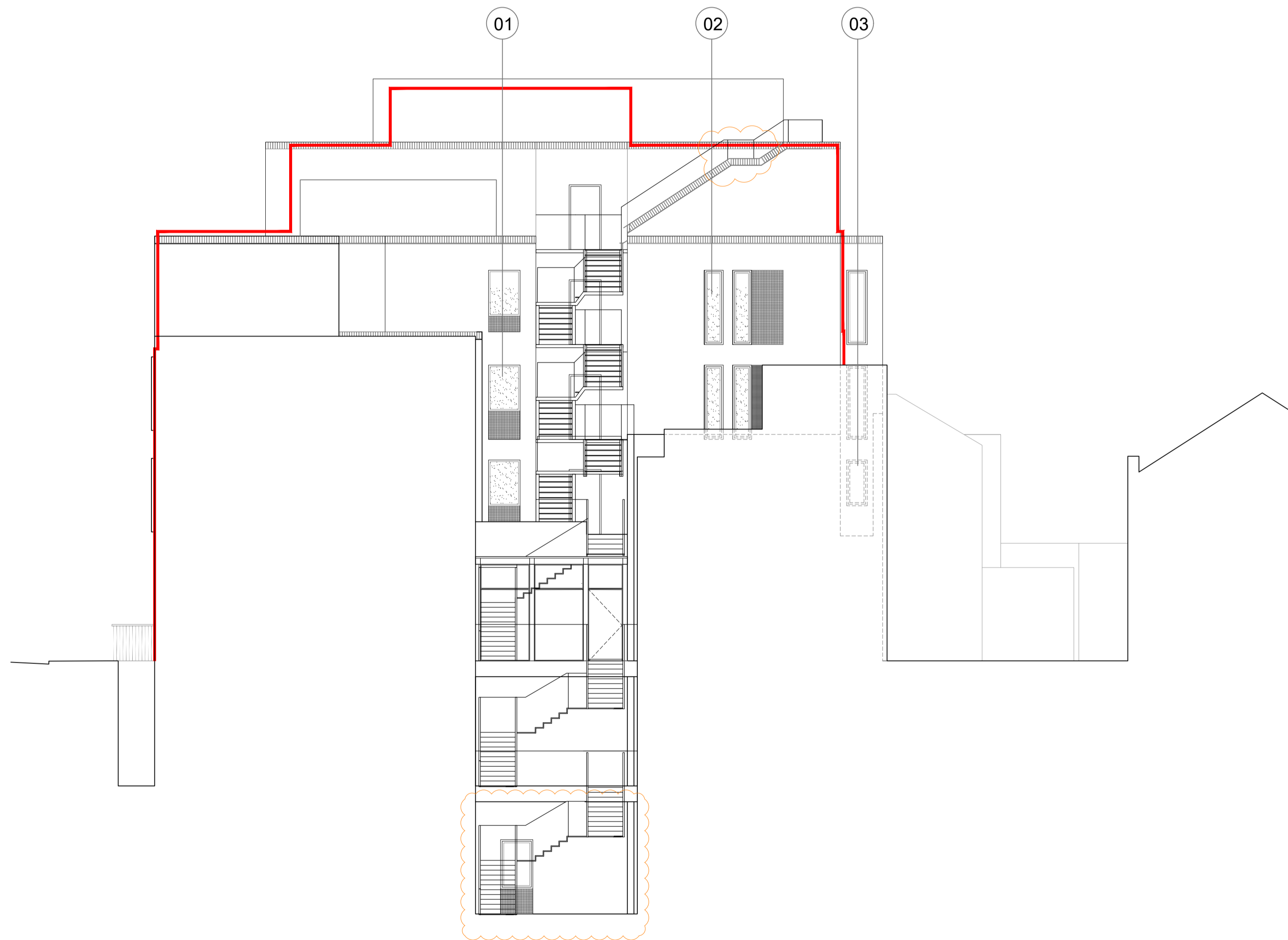
North Elevation 1:100