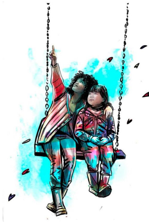
The proposed mural