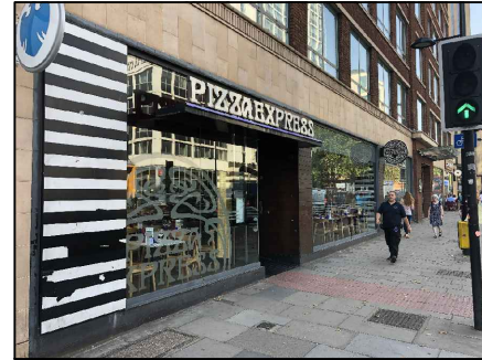
VIEW FROM EUSTON ROAD - LHS