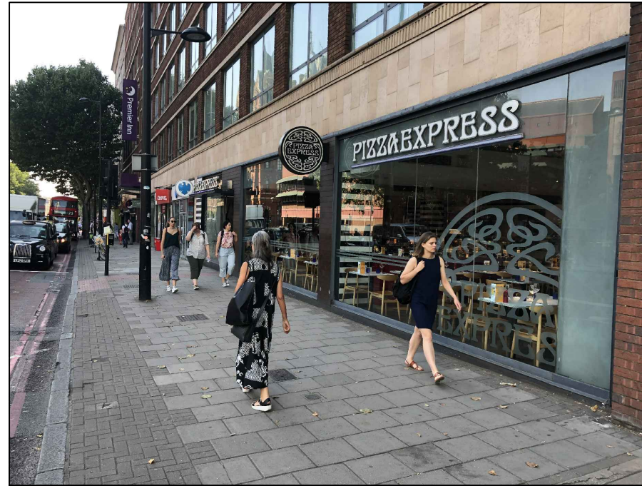
VIEW FROM EUSTON ROAD - RHS