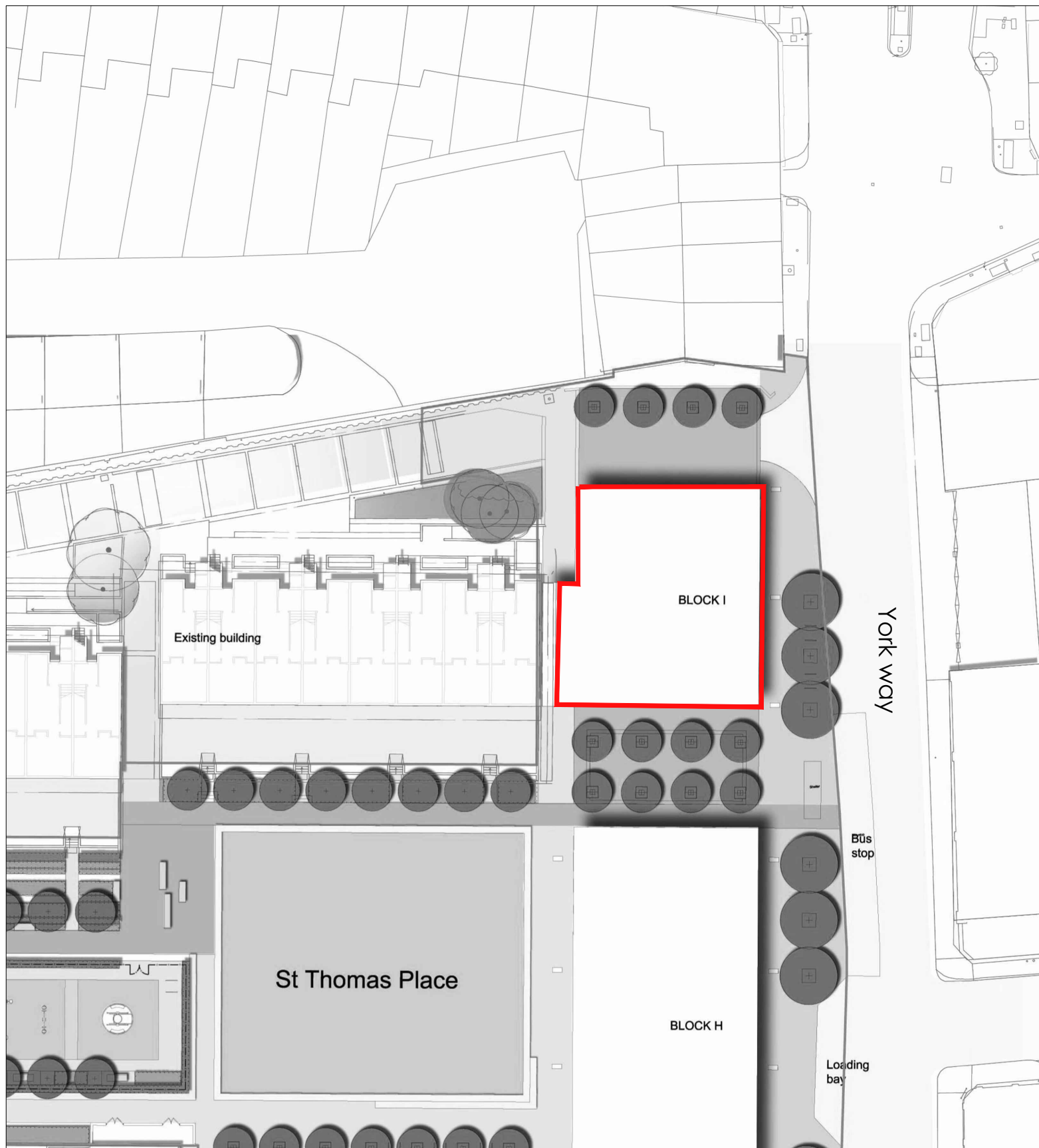
SCALE 1:500 @ A3