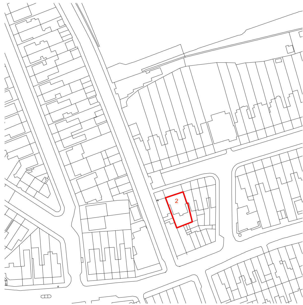
site location plan