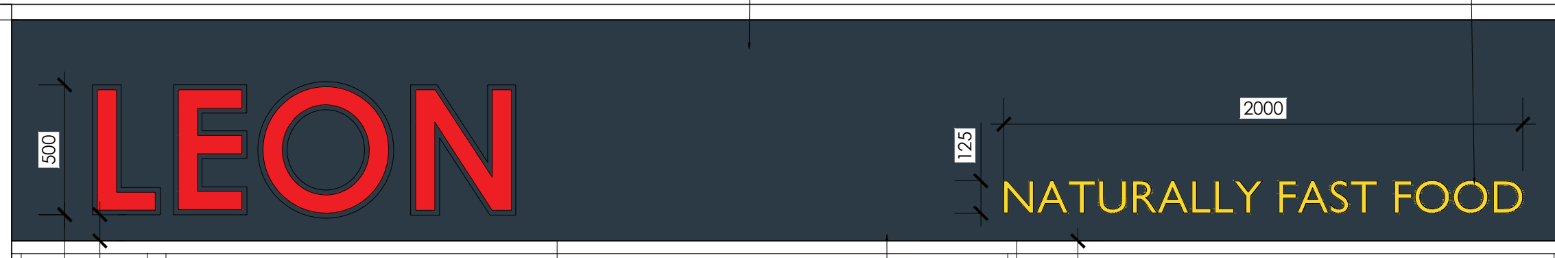
Fascia signage overview- as proposed scale - 1:10 @ A1 / 1:20@ A3

Naturally Fast Food signage stencil painted on fascia panell in gold. Details and final design by signage contractor.