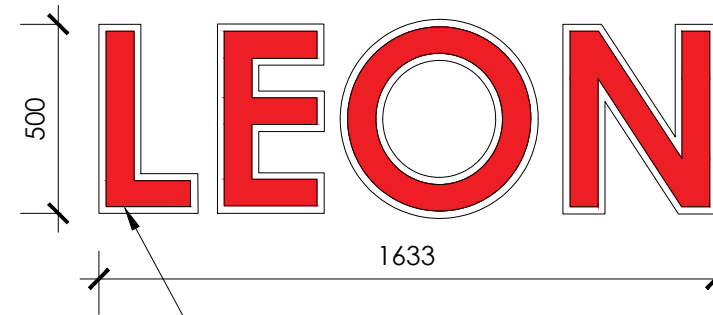
Fascia signage- as proposed scale - 1:10 @ A1 / 1:20@ A3

New,individually illuminated LEON letters fixed back to existing fascia panel.LED lights to be red not white. Details and final design by signage contractor. Luminance level = 250 candela per SQM. U/S @ 2870mm AFFL. Details and final design by signage contractor.