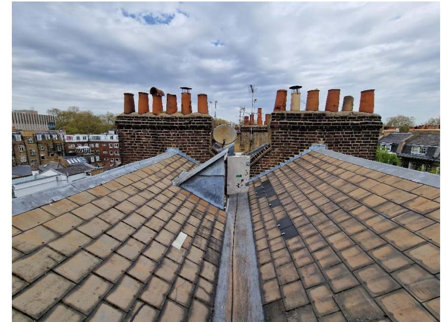
Figure 5: Existing Roof Construction

The existing gable mansard roofs have a slate tile finish. The finishes seem to be in reasonable condition with no significant defects observed.