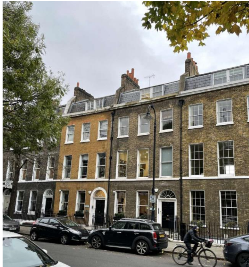
Figure 3: Front Elevation

The front elevation appears to be in reasonable condition and comprises of rendered up to ground floor with exposed brickwork above and a tiled mansard roof at fourth floor level.