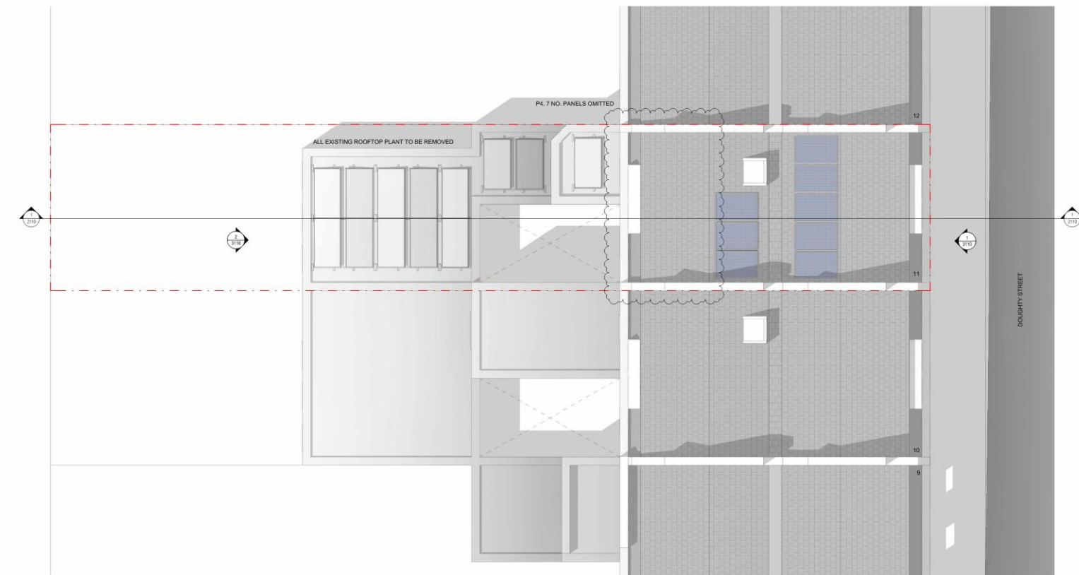
Figure 6: Proposed Roof Plan

The construction of the rear extension flat roof was not accessible though given the roof currently houses plant, which is to be removed, it will have adequate residual capacity for the proposed panels.