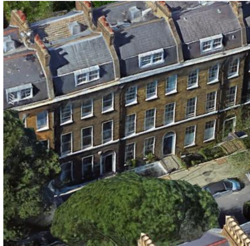
Figure 1: Birdseye View of property (Google Earth)

During the inspection, a general review of the structural integrity of the property was carried out as far as practicable without the removal of finishes.