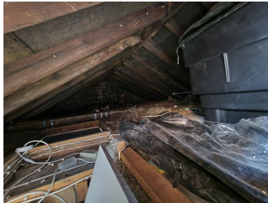
Figure 4: Existing Roof Construction

There are signs of historic water ingress, and some local areas of damp however no significant structural defects were observed in the areas that were accessible.