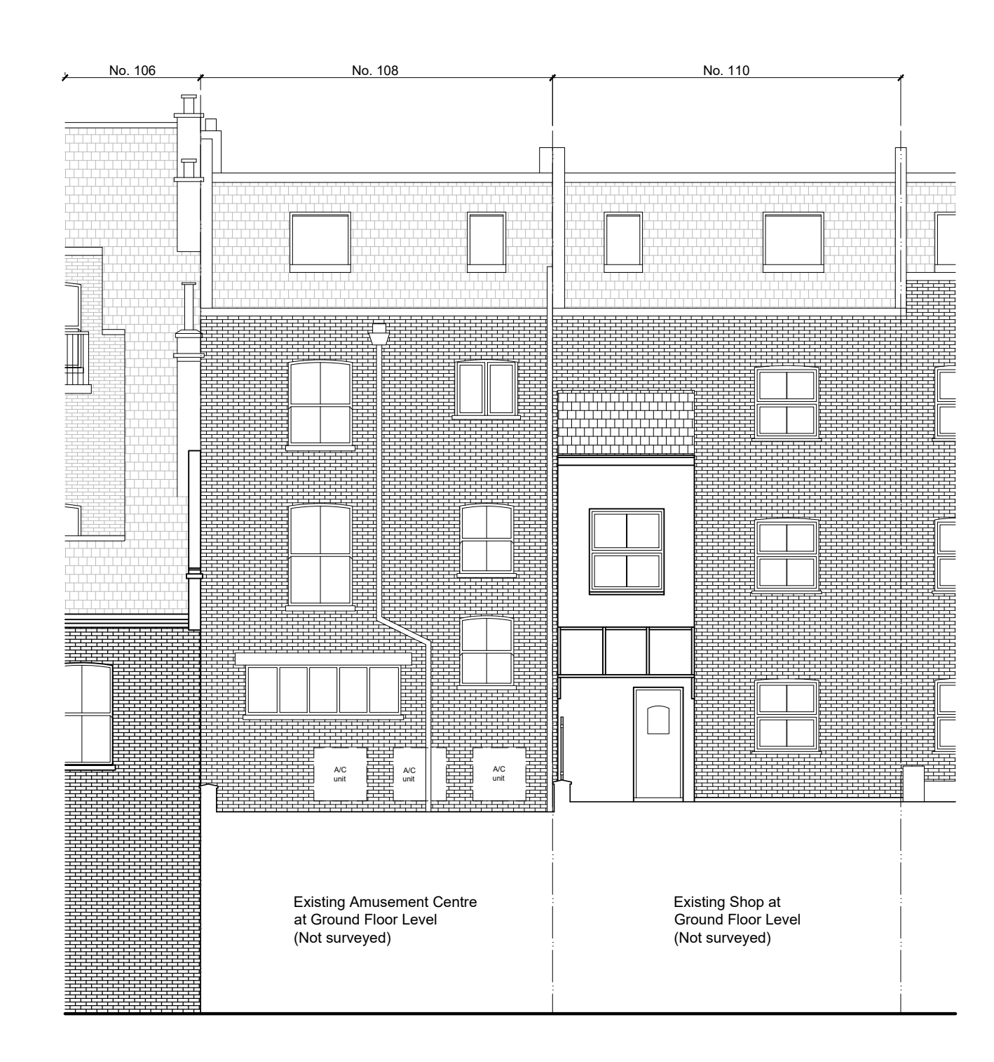
Proposed Rear (North-East) Elevation Scale 1:100